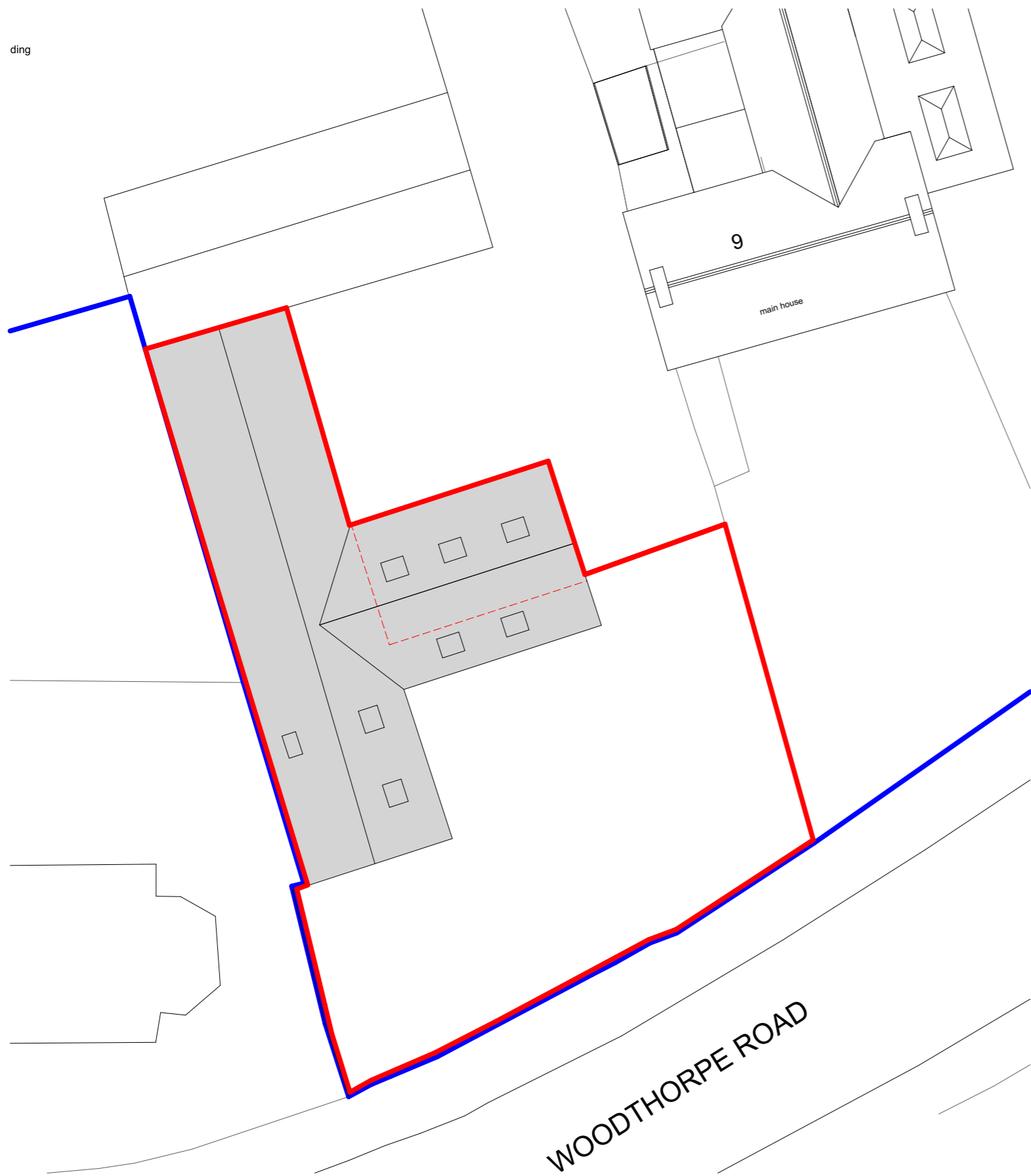
Site Block Plan Scale 1:200