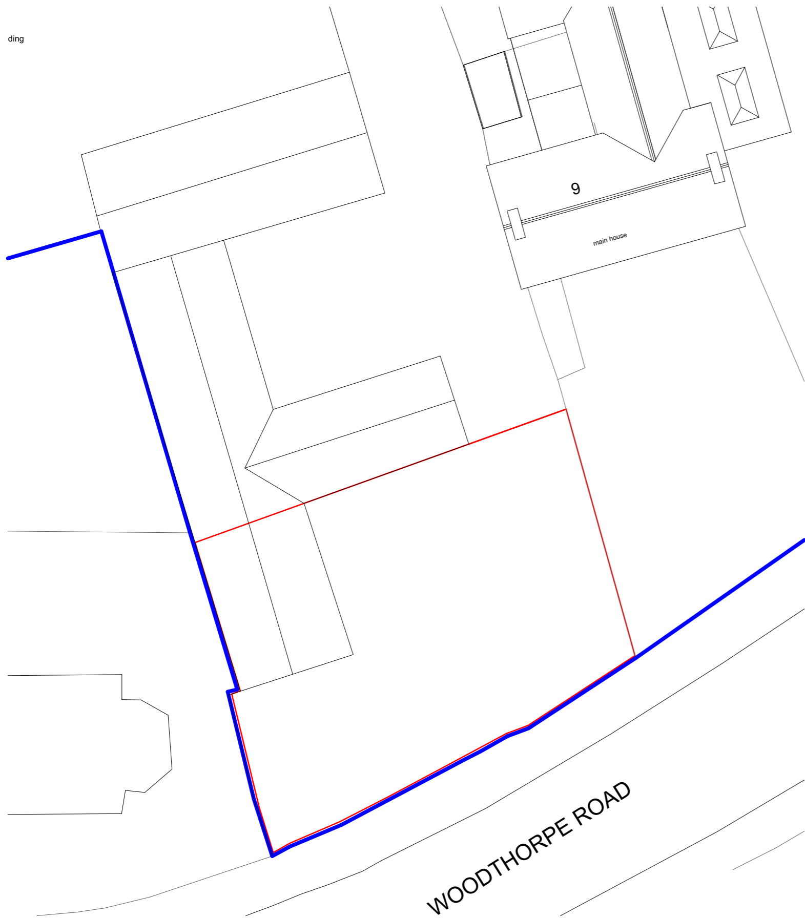
Site Block Plan Scale 1:200