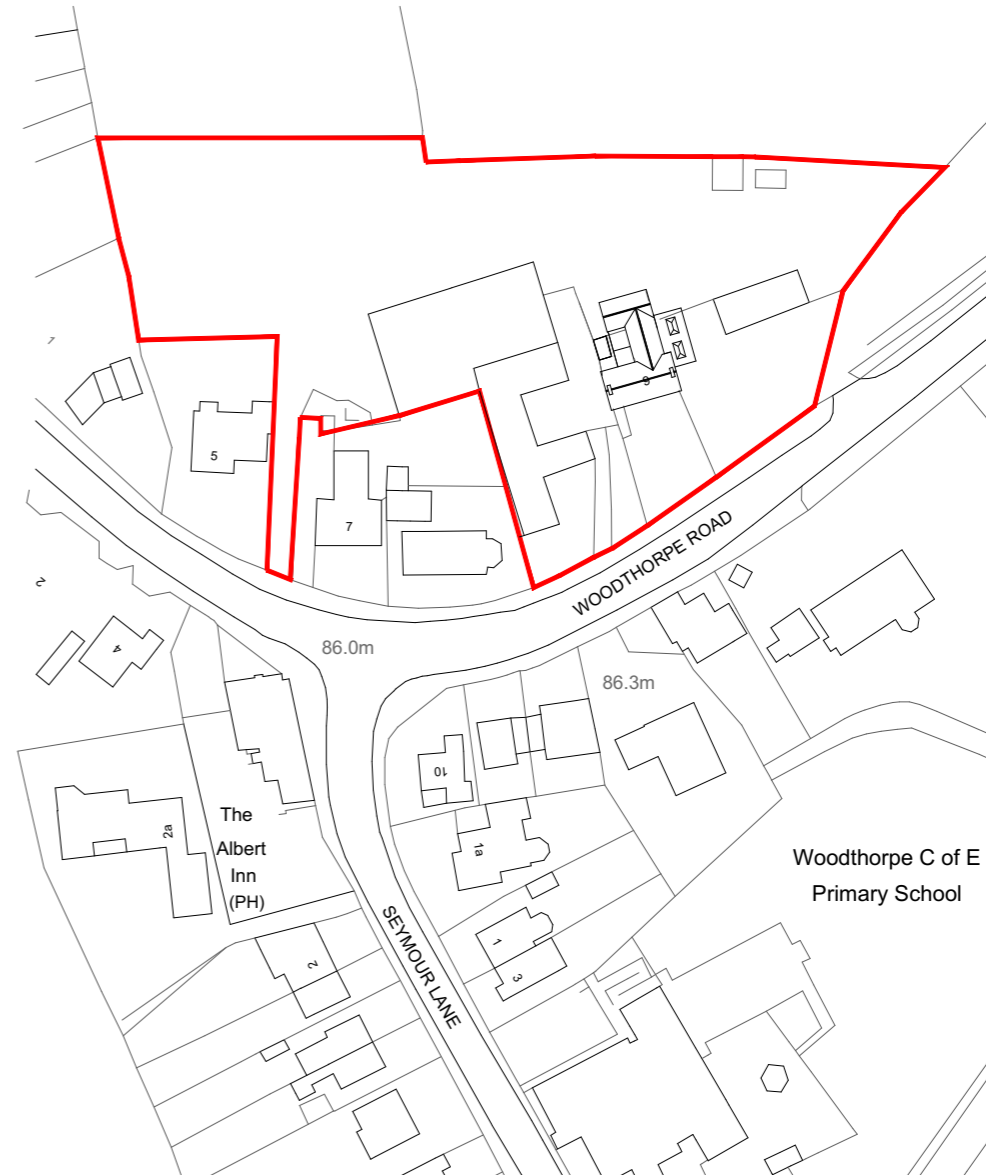
Site Location Plan Scale 1:1250