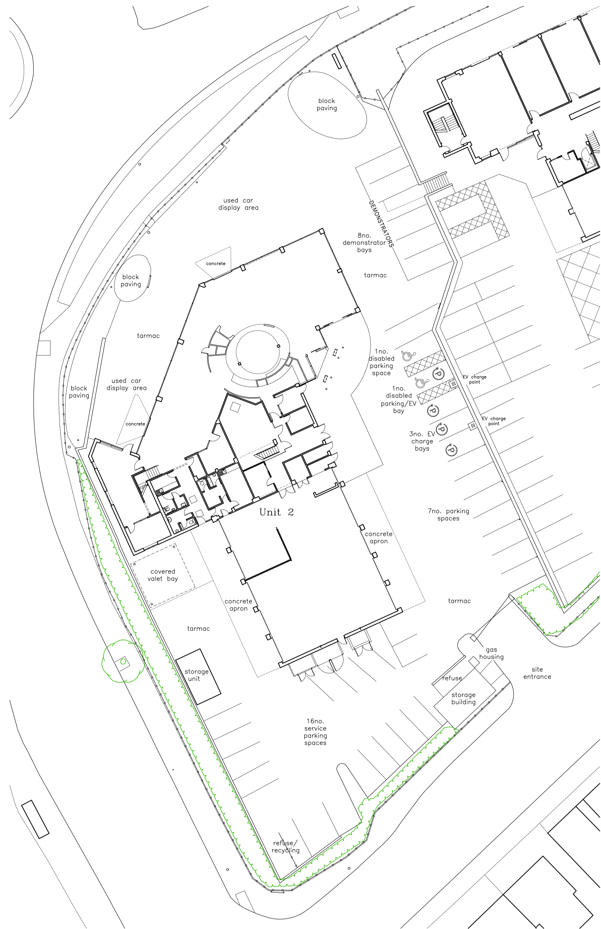
EXISTING SITE LAYOUT scale 1:250