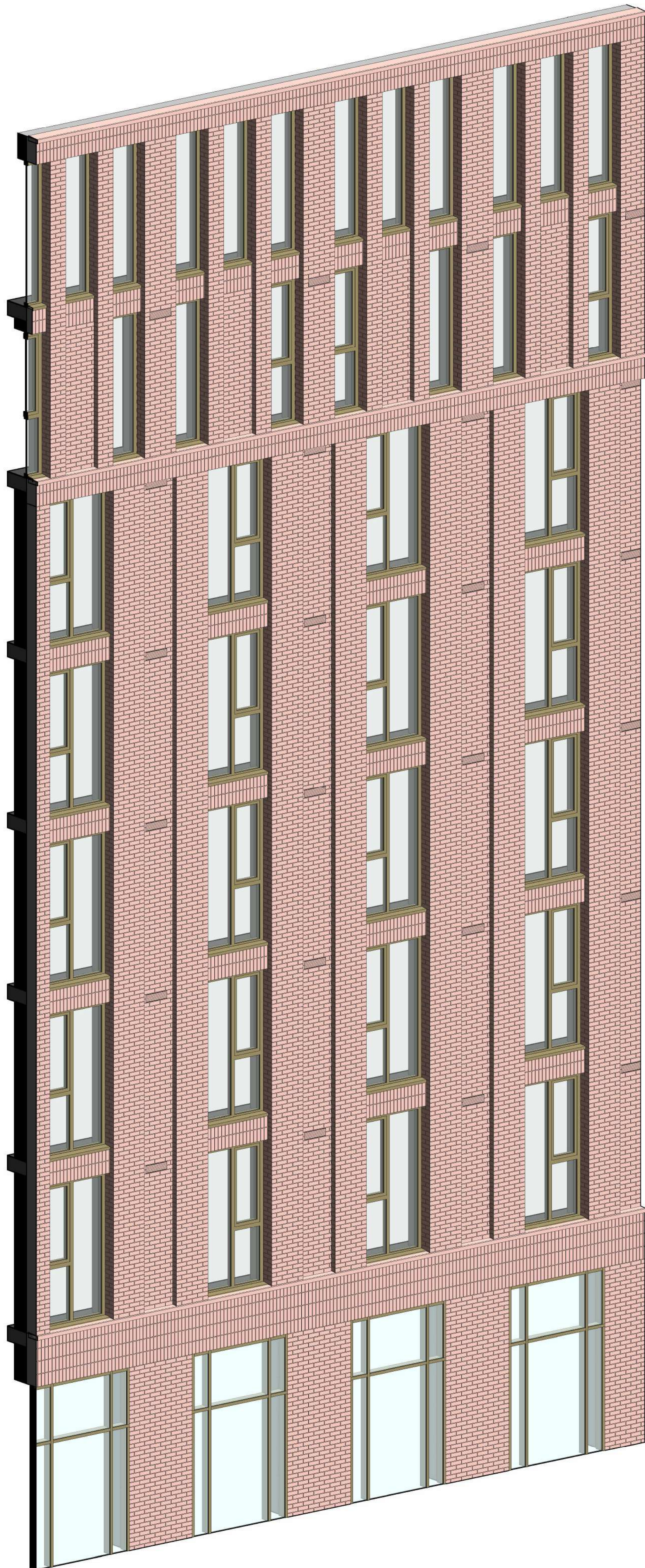
Proposed PBSA Isometric Bay Details 1