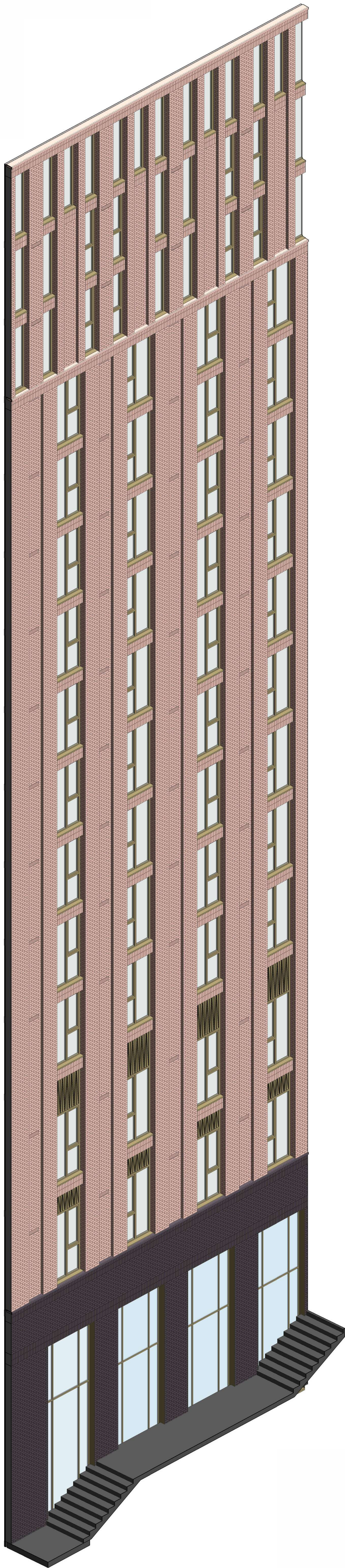
Proposed PBSA Isometric Bay Details 2

Do not scale from drawing. Use figured dimensions only. All dimensions to be checked on site by the contractor and any discrepancies to be notified to the architect prior to works being carried out.