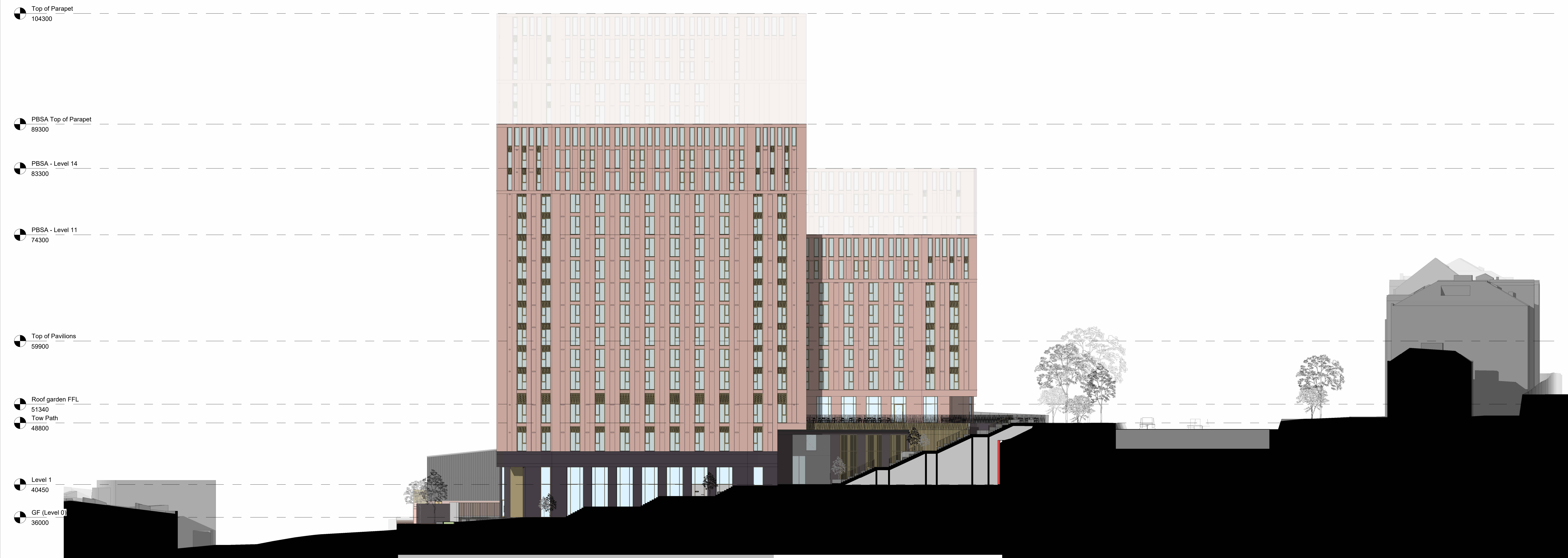
Site Section B-B - Through South Steps 1 : 200

Revisions: PLANNING Title: Proposed Site Cross Section Project: New Rotterdam Wharf Client: Scottish Opera Drawing No: NRW-PPA-0-XX-DR-A-1200 Scale: As indicated @ A0 Revision: Date: 19/02/2024 PAGE \ PARK Page Park Architects 20 James Morrison Street, Glasgow G1 5PE, UK T 0141 553 5460 F 0141553 5441 mail@pagepark.co.uk www.pagepark.co.uk