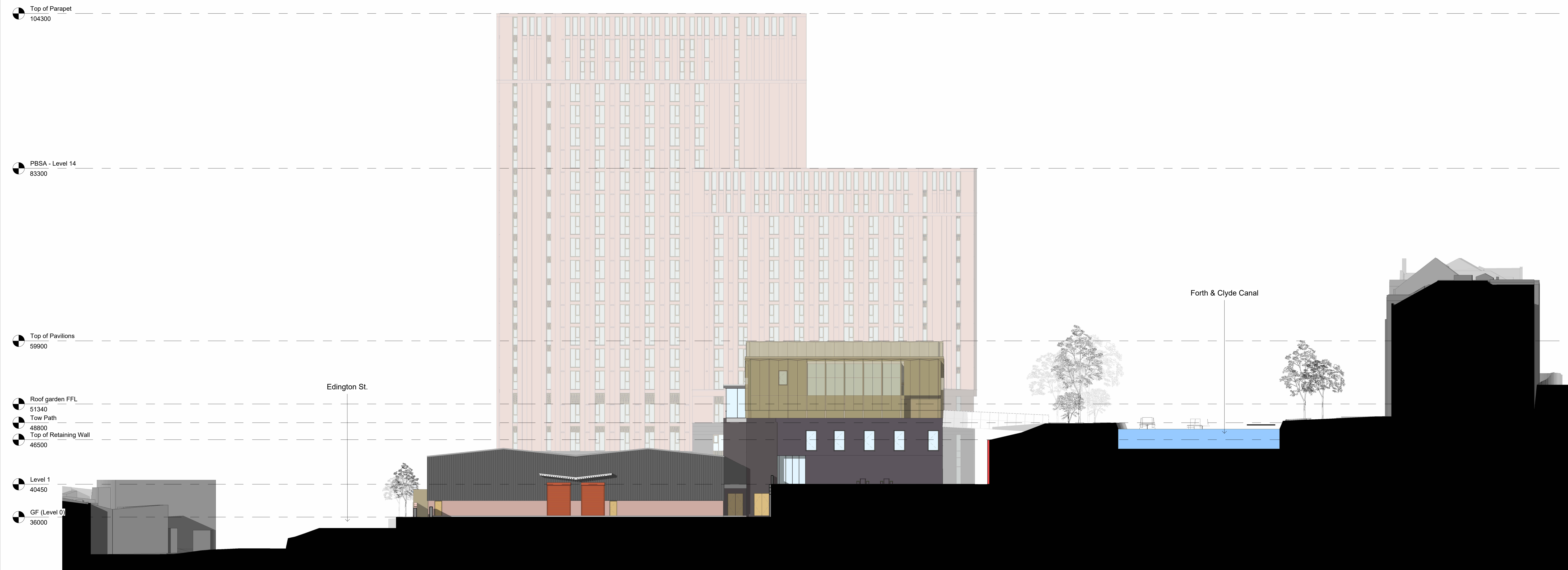
Site Section A-A - Through South Courtyard 1 : 200