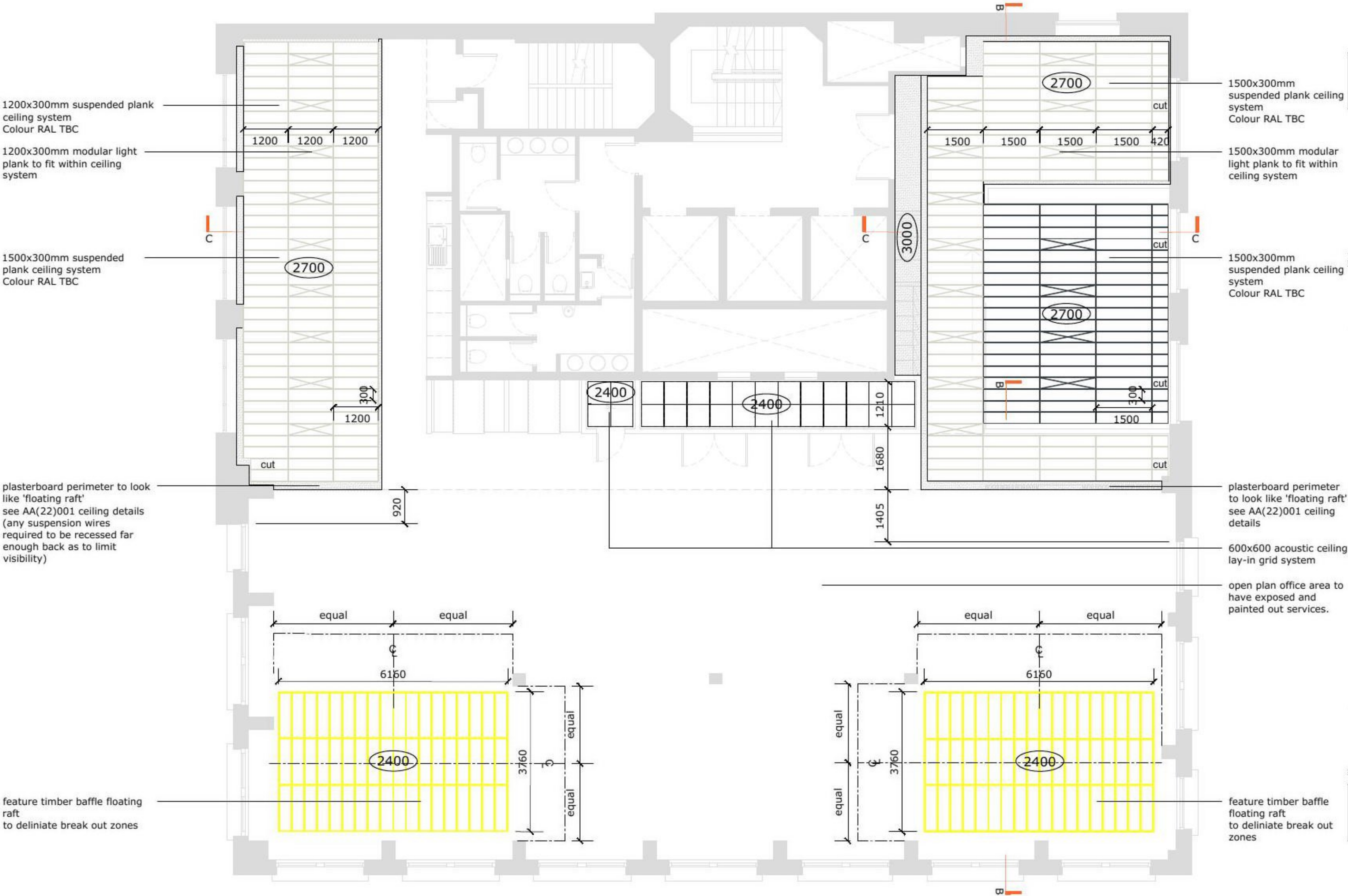
Proposed Reflected Ceiling Plan