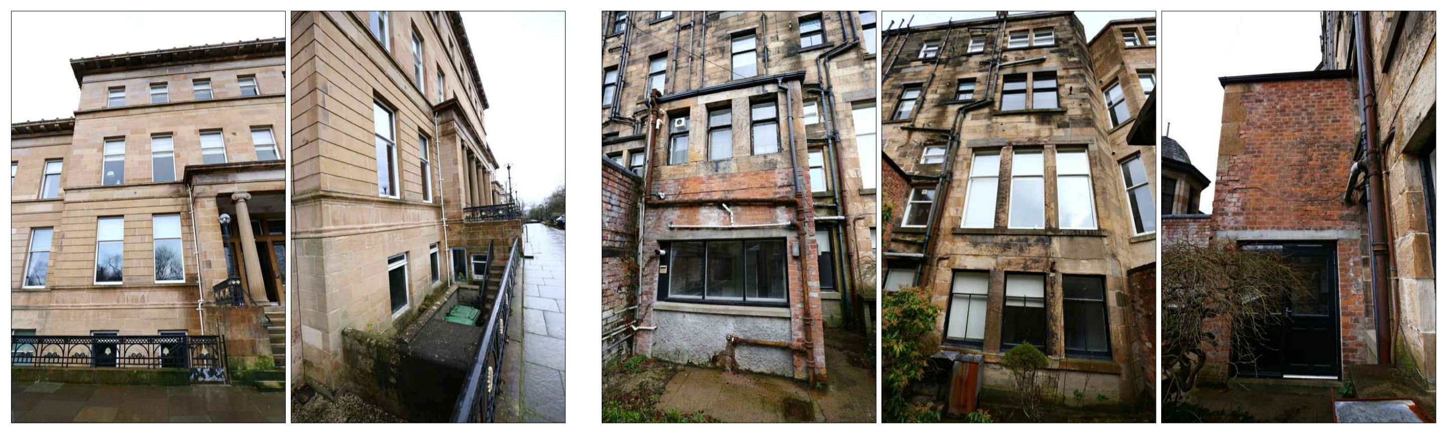
EXISTING FRONT ELEVATIONS