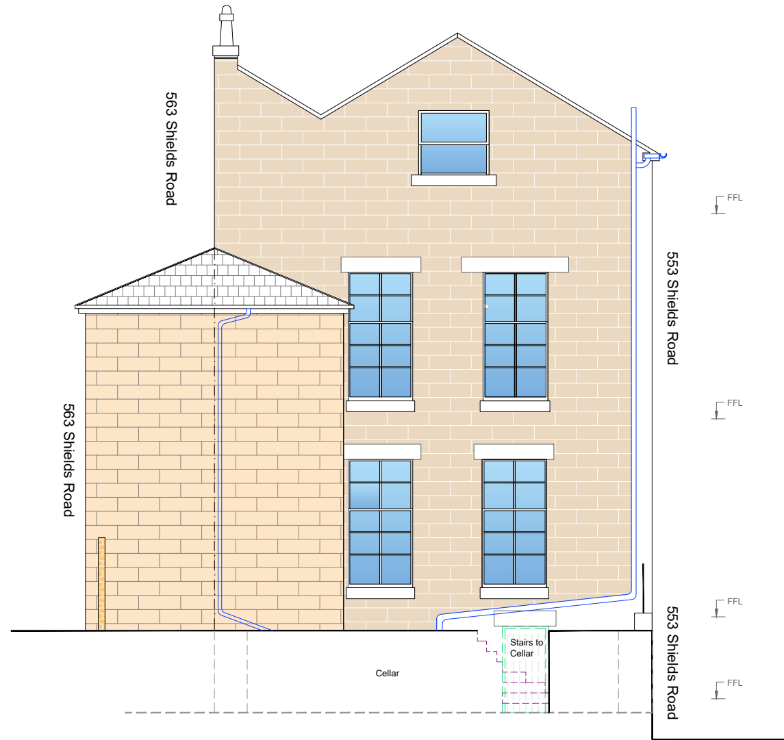
Rear Elevation Scale: 1/100 @ A3