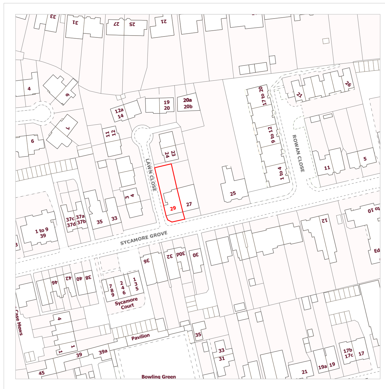
EXISTING LOCATION PLAN