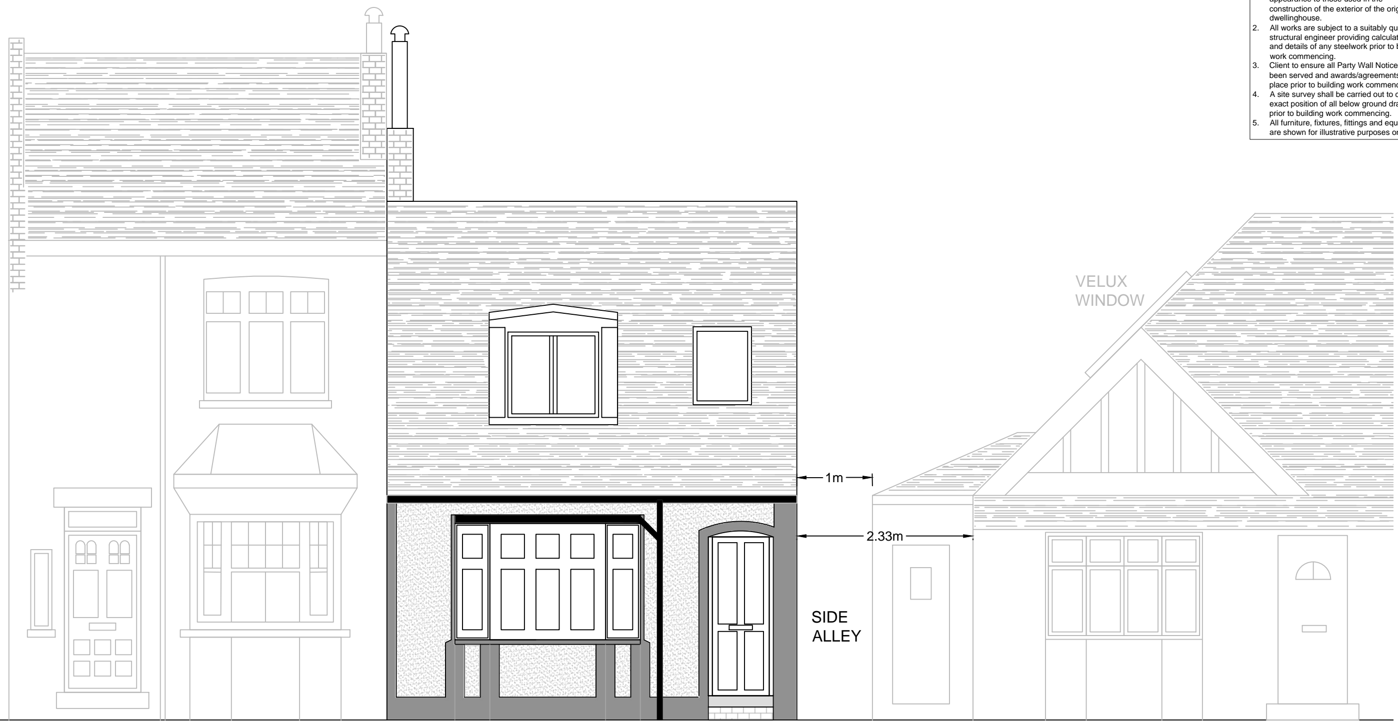
⊙ EXISTING FRONT ELEVATION 1:50 @ A3