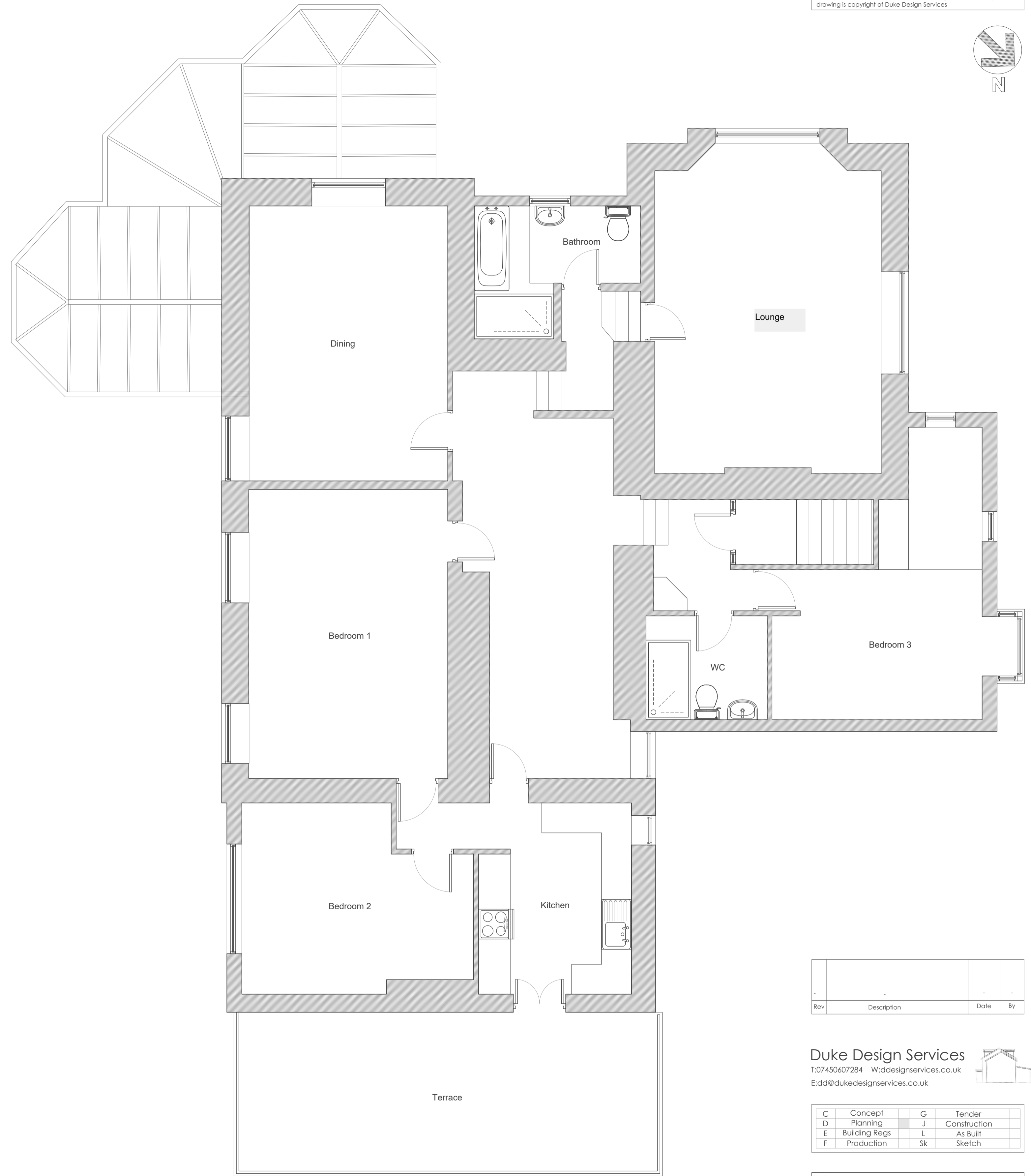
First Floor 1:50