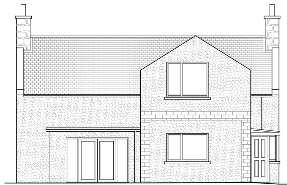
South Elevation : Scale 1 : 100