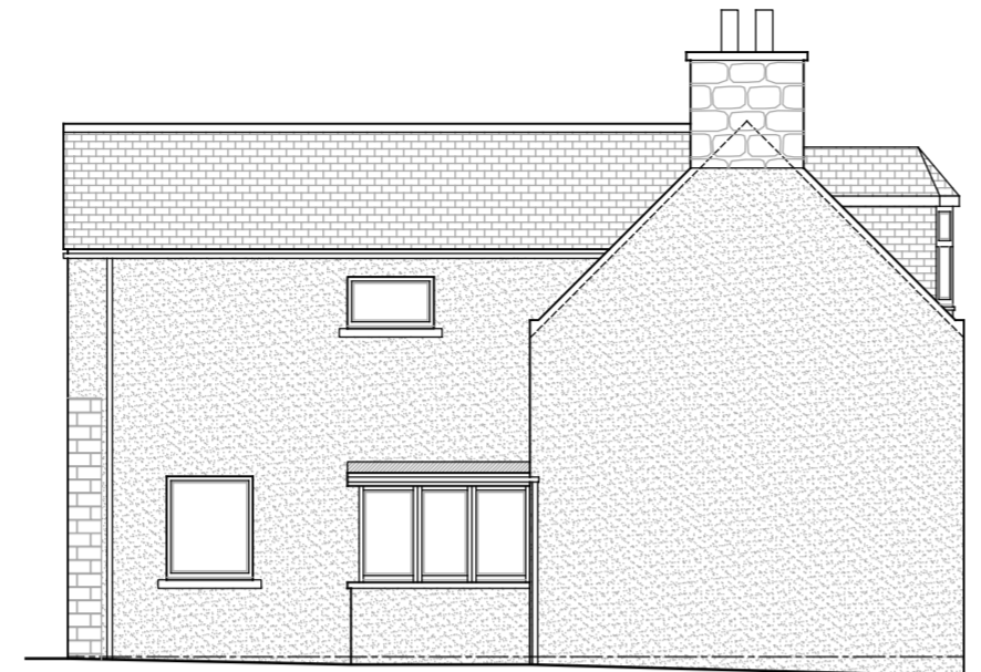
East Elevation : Scale 1 : 100