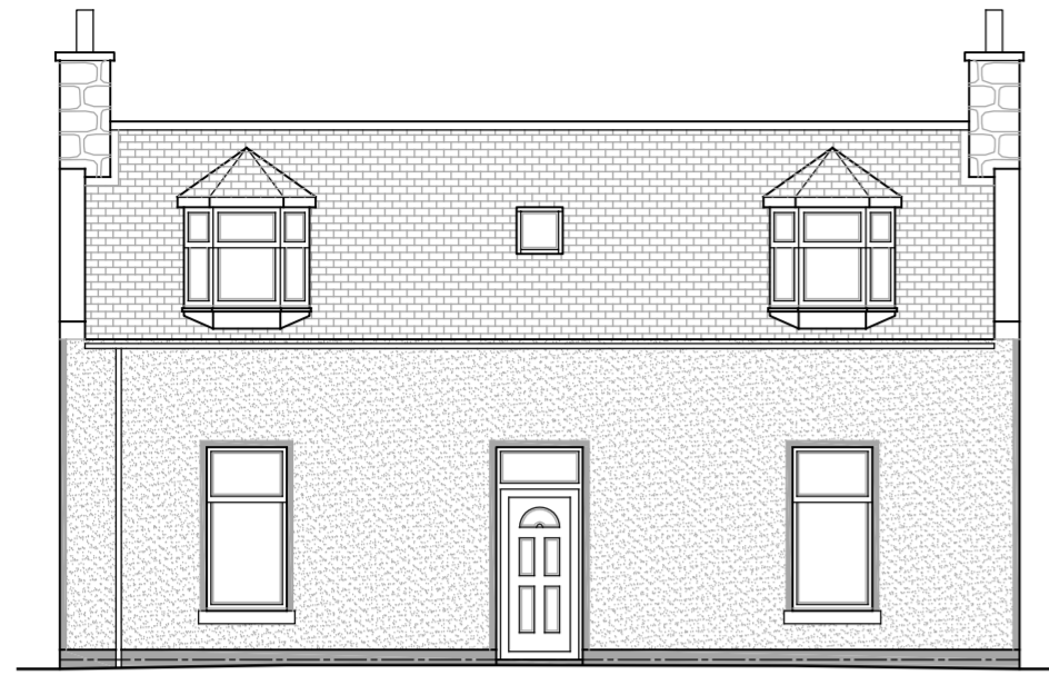
North Elevation : Scale 1 : 100