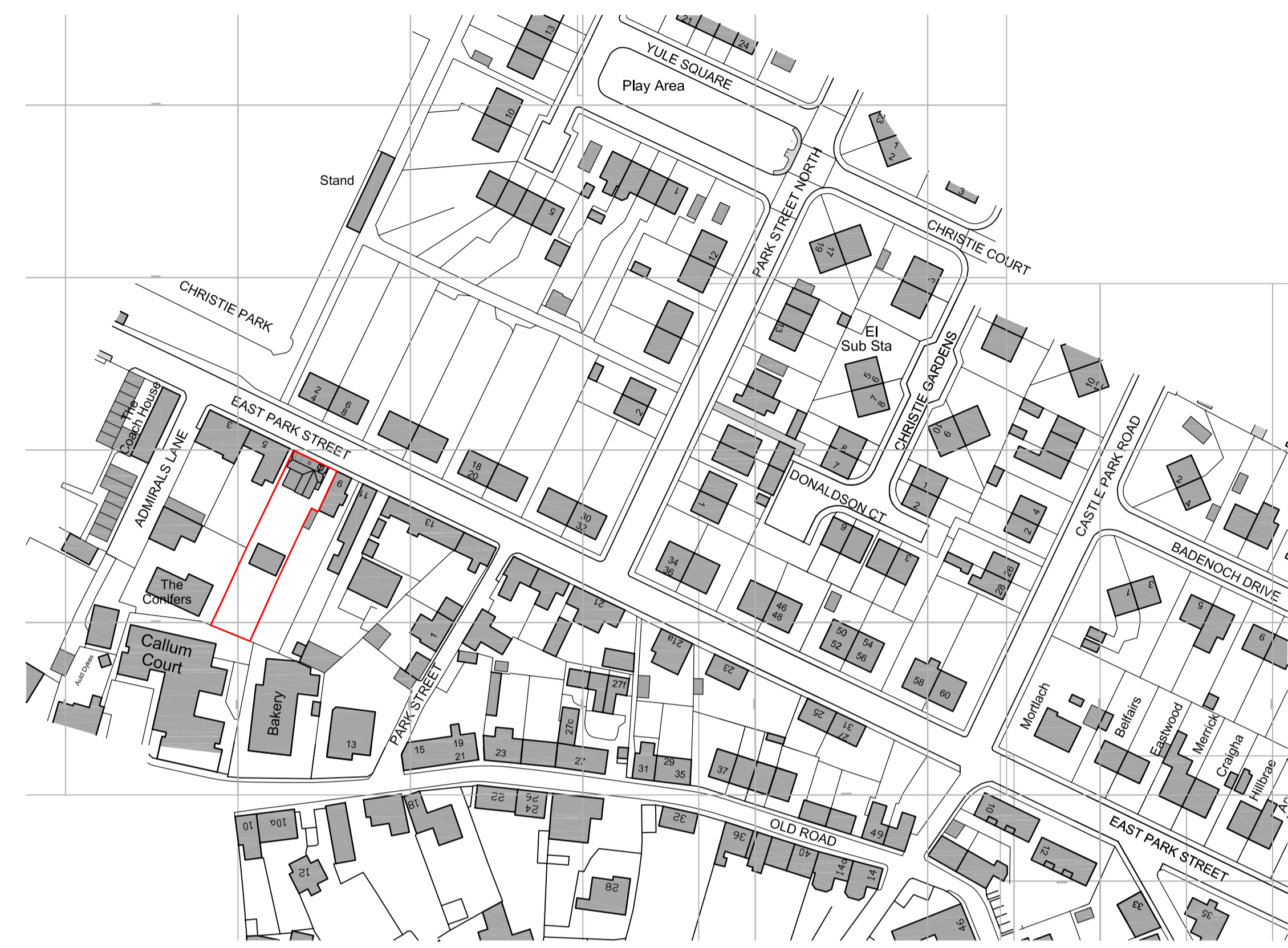
Location Plan : Scale 1 : 1250