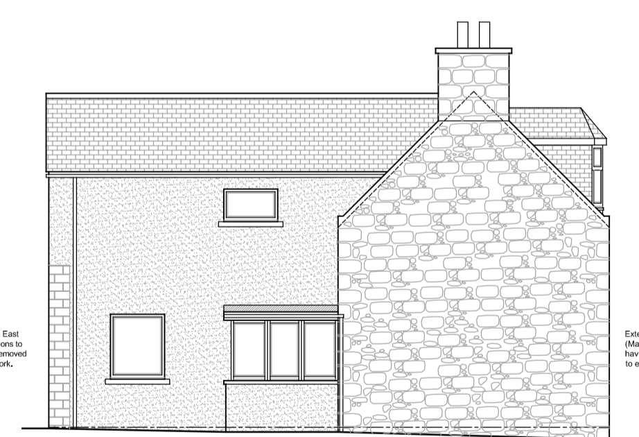
East Elevation : Scale 1 : 100