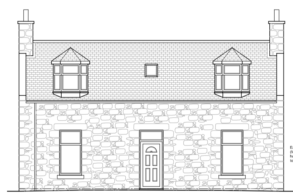
North Elevation : Scale 1 : 100