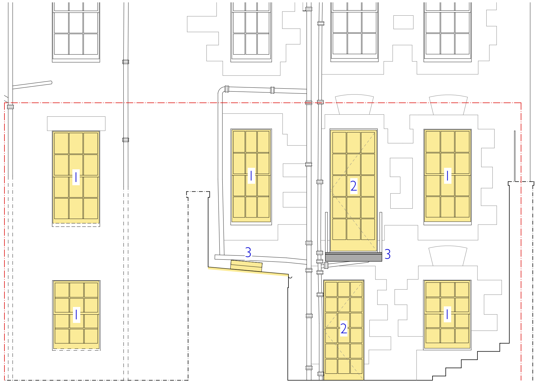
1 Proposed Rear Elevation Scale: 1:50