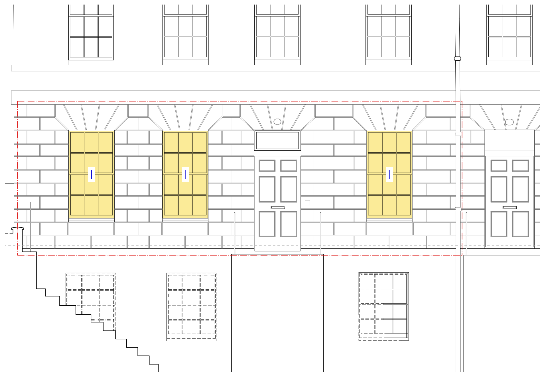
1 Proposed Front Elevation Scale: 1:50

I - Existing refurbished / new slimline double glazed, timber sash & case windows to match existing windows