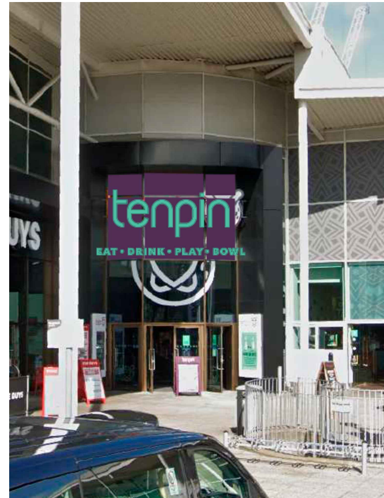
Photomontage of Proposed Sign 01 in Front elevation. (Existing vinyls to be removed).