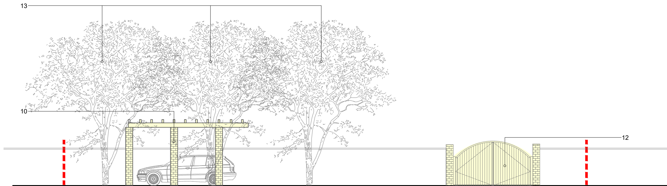
02 Site Entrance and Car Port East Elevation 1:100