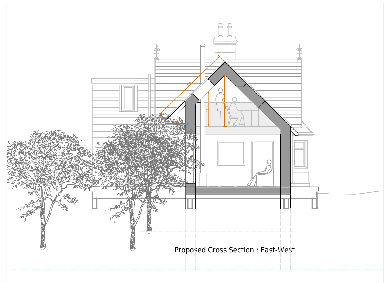
Proposed Cross Section : East-West