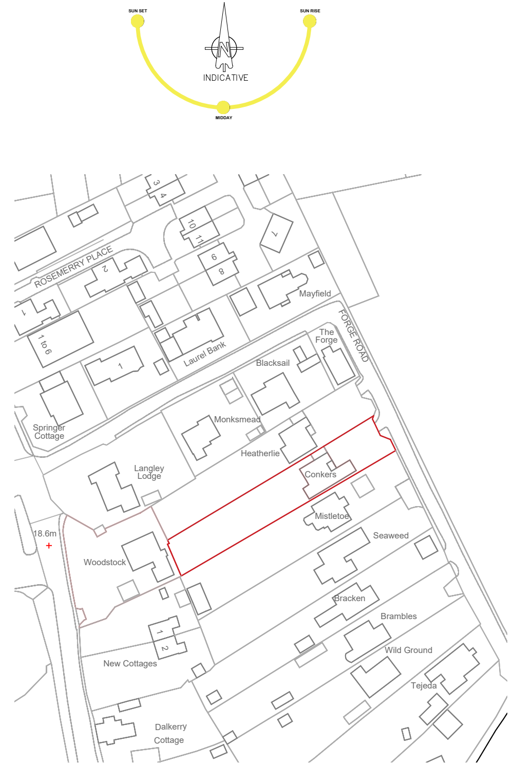
Location Plan -SCALE 1:1250