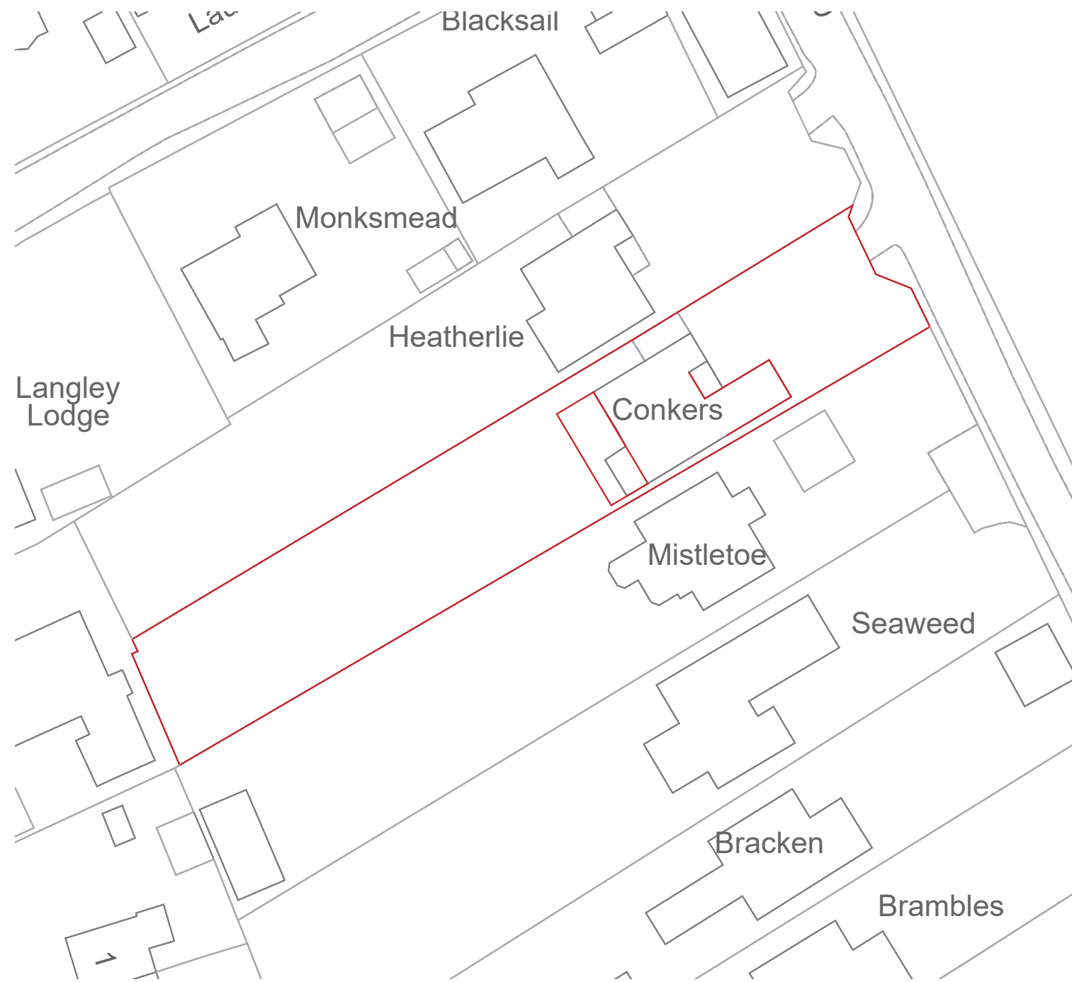
Block Plan -SCALE 1:500

copyright: this drawing is the copyright of MARCHitecture Architectural Design and may not be reproduced without their permission in writing note: it is the contractors responsibility to check all dimensions and levels on site and report all discrepancies immediately to the architect the contractor should not scale off the drawings under any circumstance.