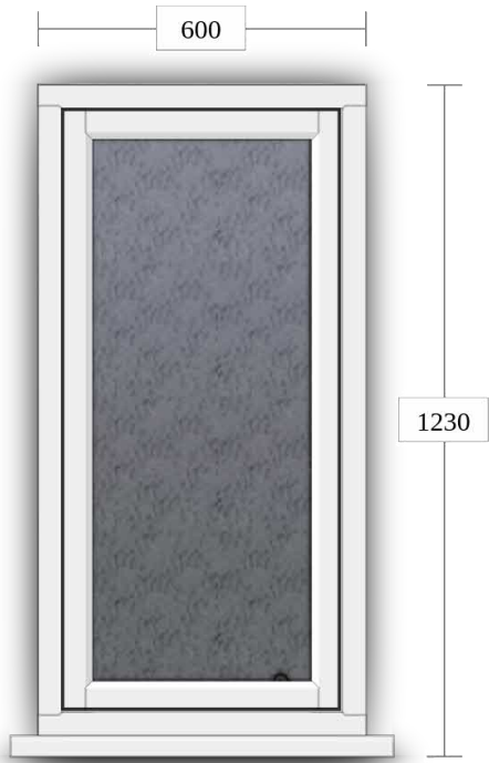
☀ Viewed from outside