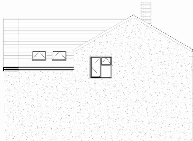
Existing Side A Elevation