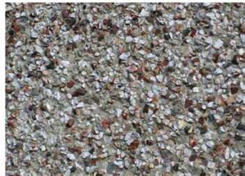
Pebble dash render Colour: Mixed Gravel Matching Existing