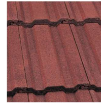
Marley Ludlow Concrete Roof Tile Colour: Dark Red