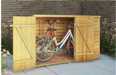
Cycle Storage Colour: Natural Timber