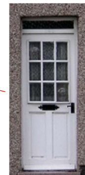
uPVC Door Colour: White