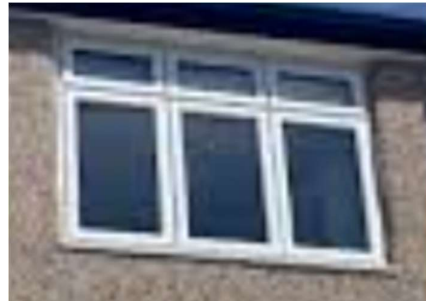
uPVC window Colour: White