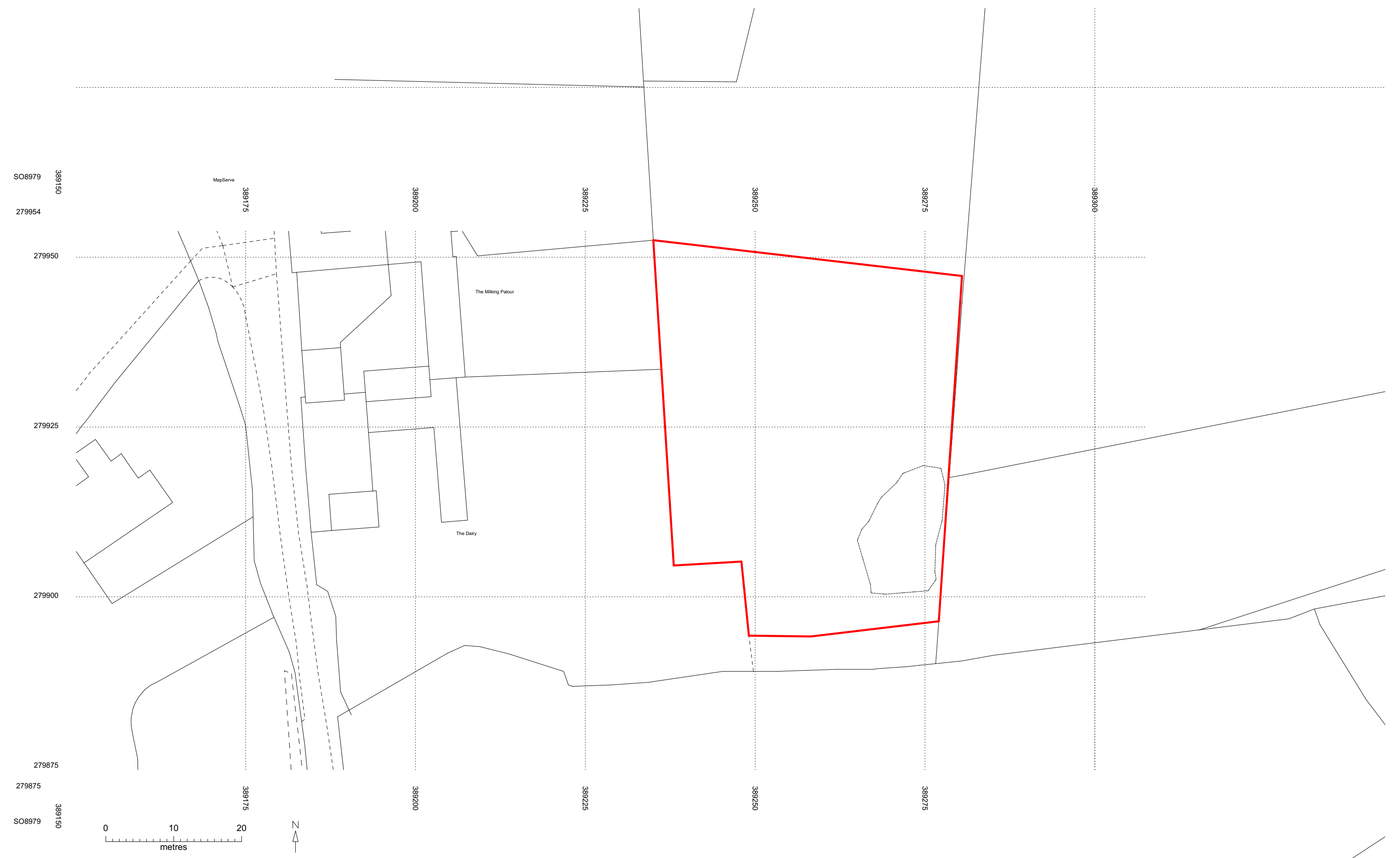
BLOCK PLAN AS EXISTING (1:500)