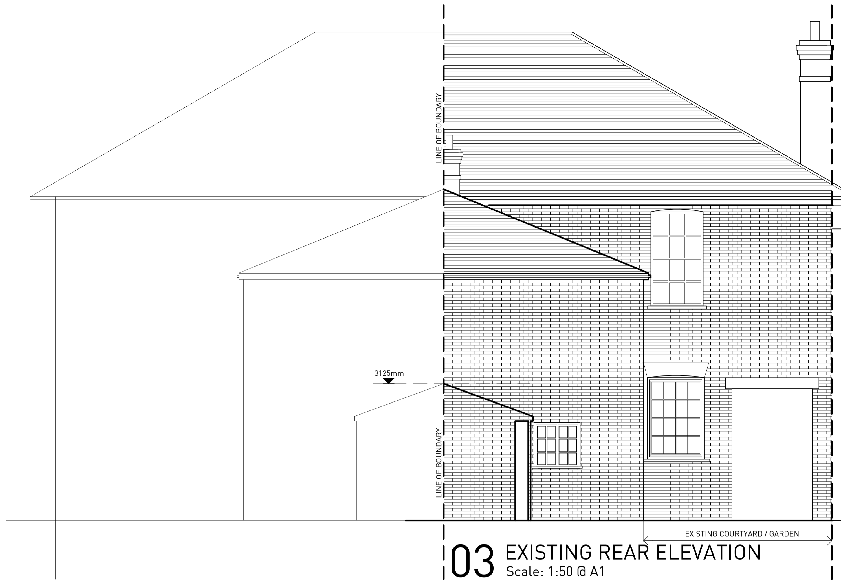
03 EXISTING REAR ELEVATION Scale: 1:50 @ A1