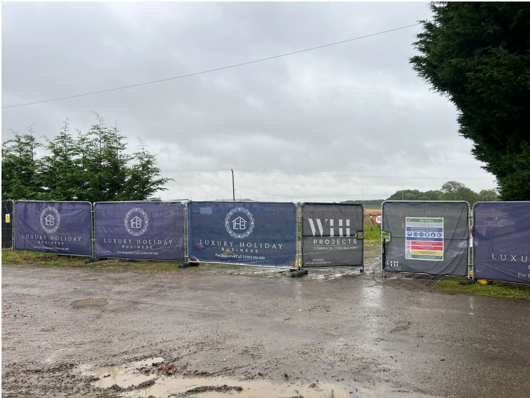
Site Image 4