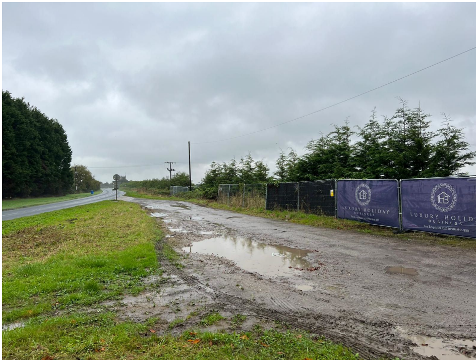
Site Image 6