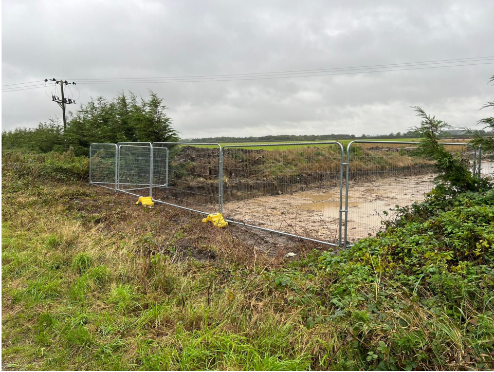
Site Image 5