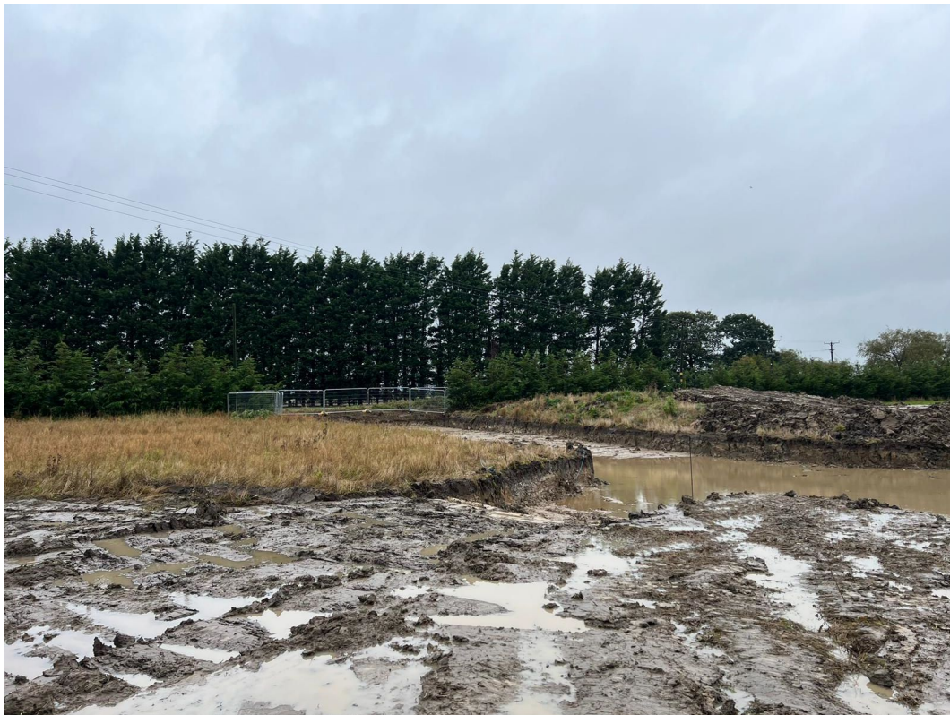
Site Image 2