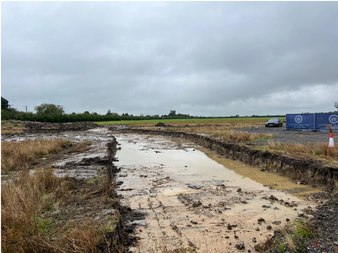
Site Image 3