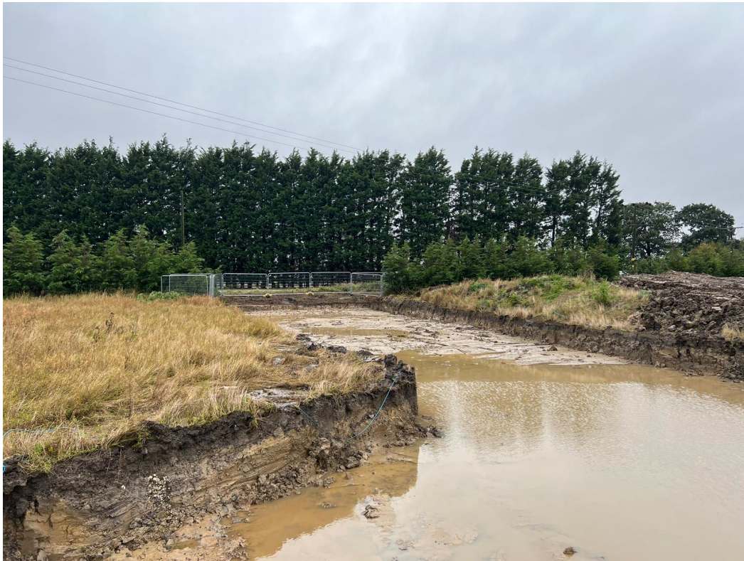
Site Image 1