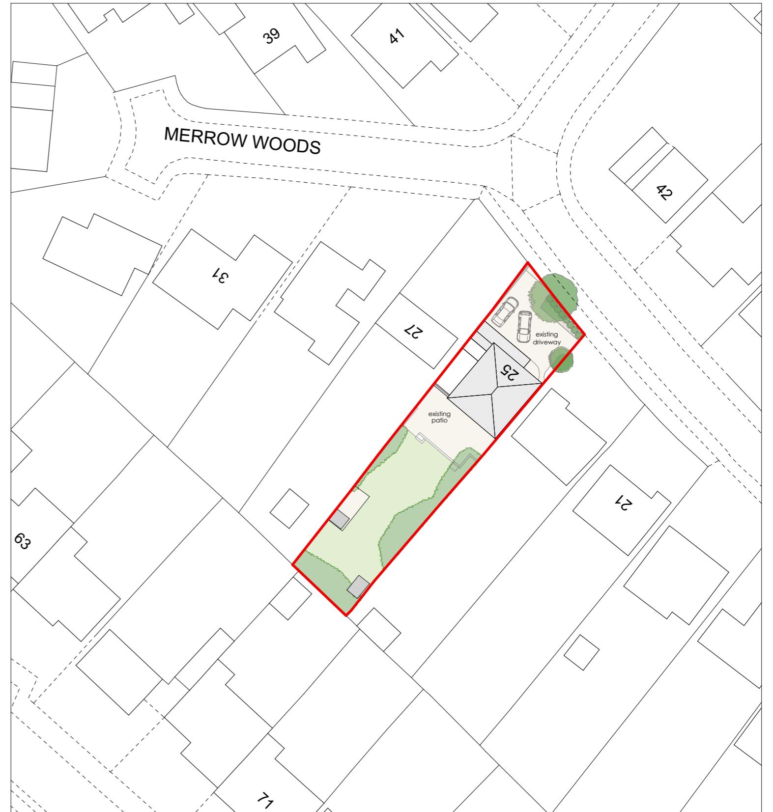
Block / Site Plan