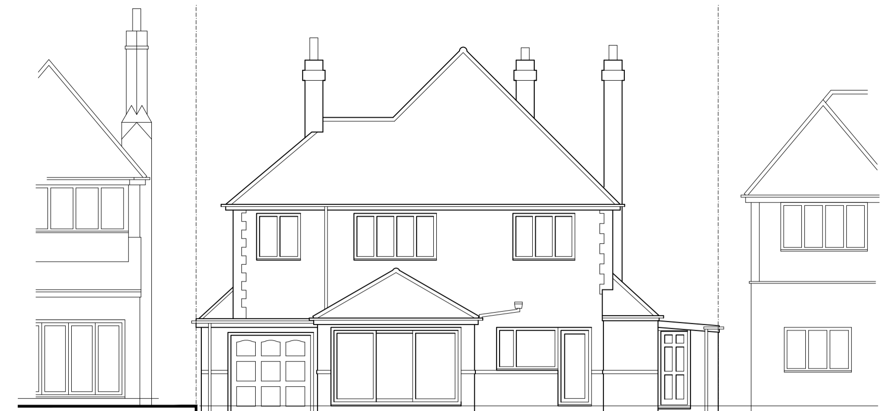
EXISTING REAR - W