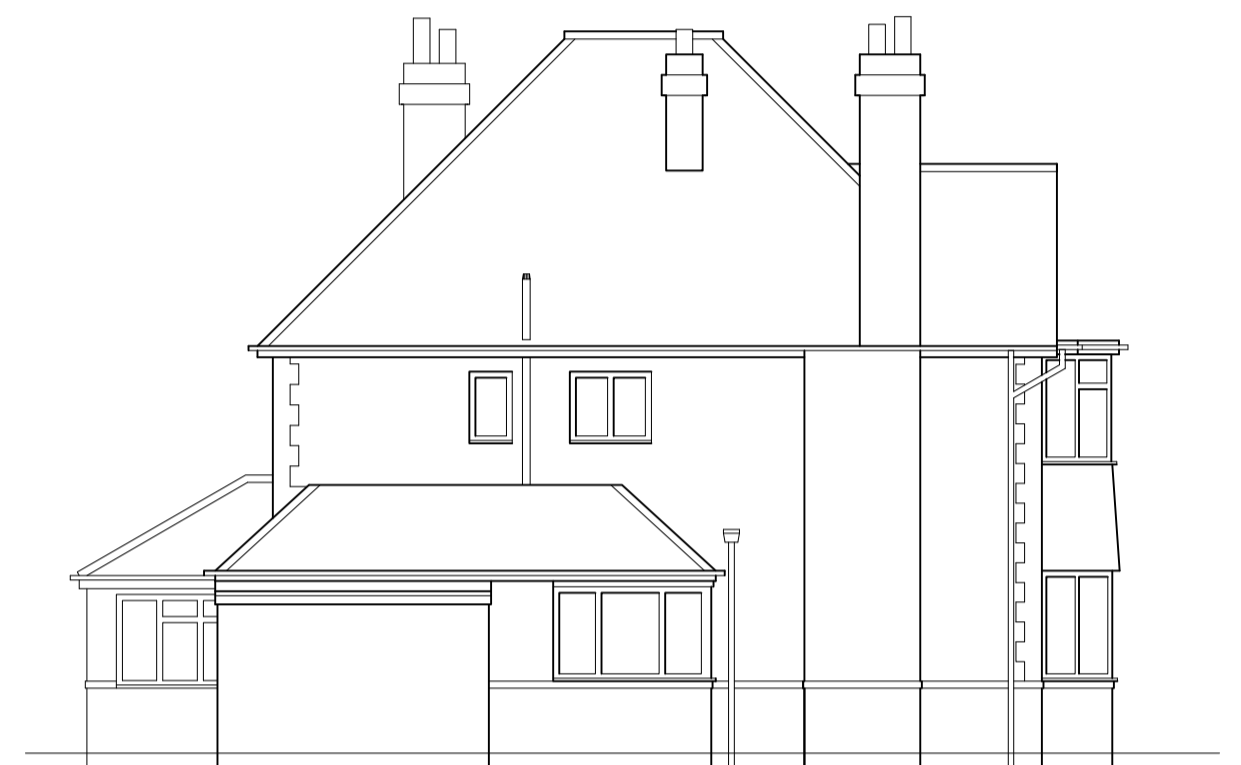
EXISTING SIDE - S