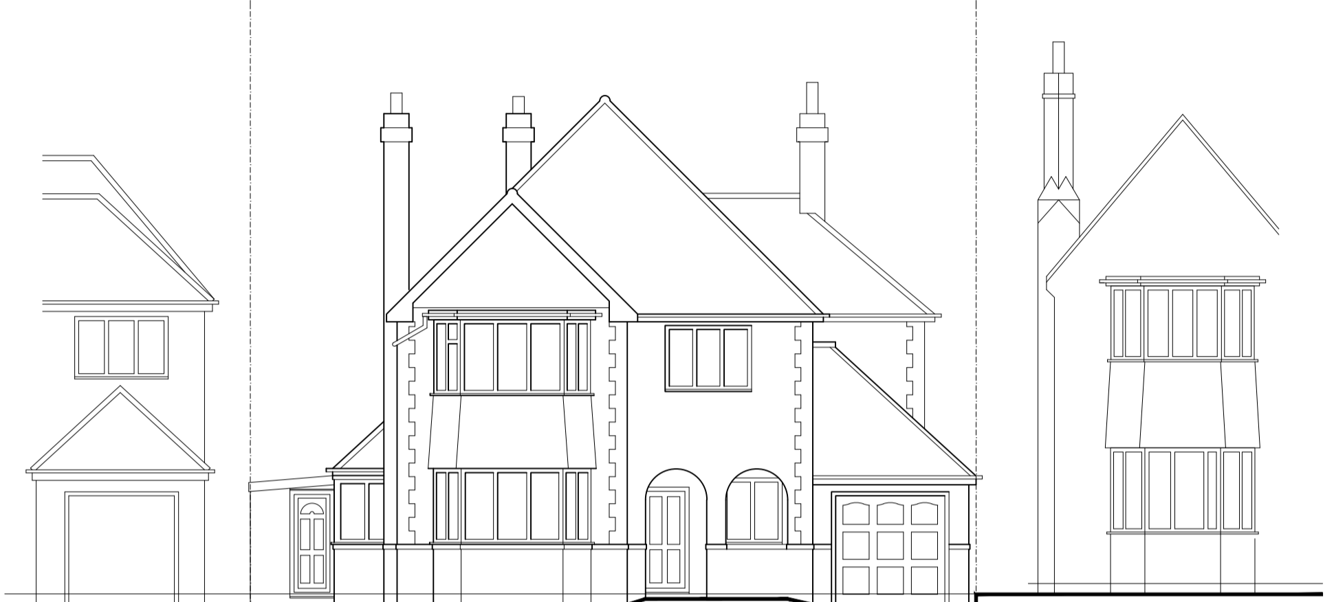
EXISTING FRONT - E