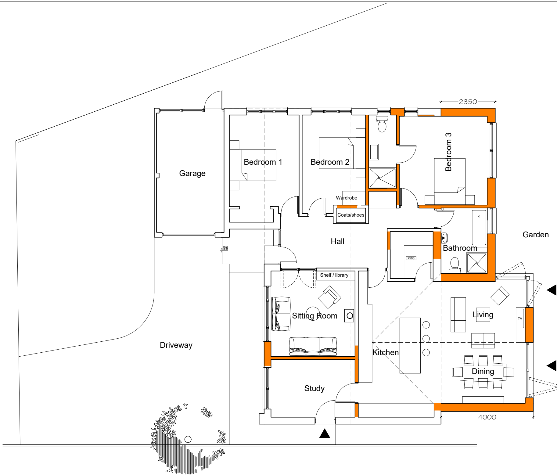
Proposed Floor Plan