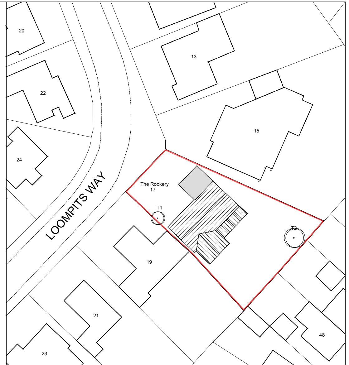
Proposed Block Plan scale 1:500