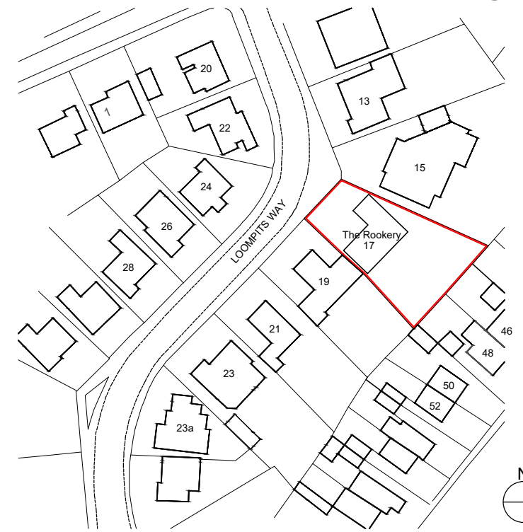
Location Plan scale 1:1250