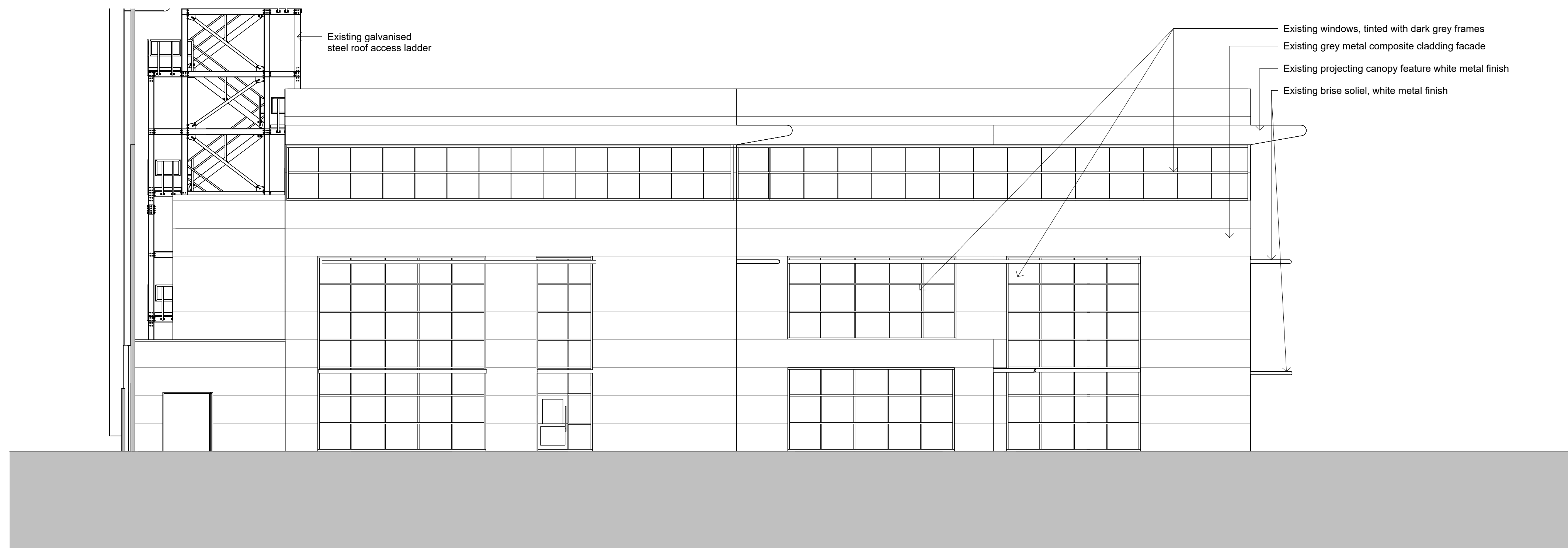
Existing ancillary office - Existing West Elevation