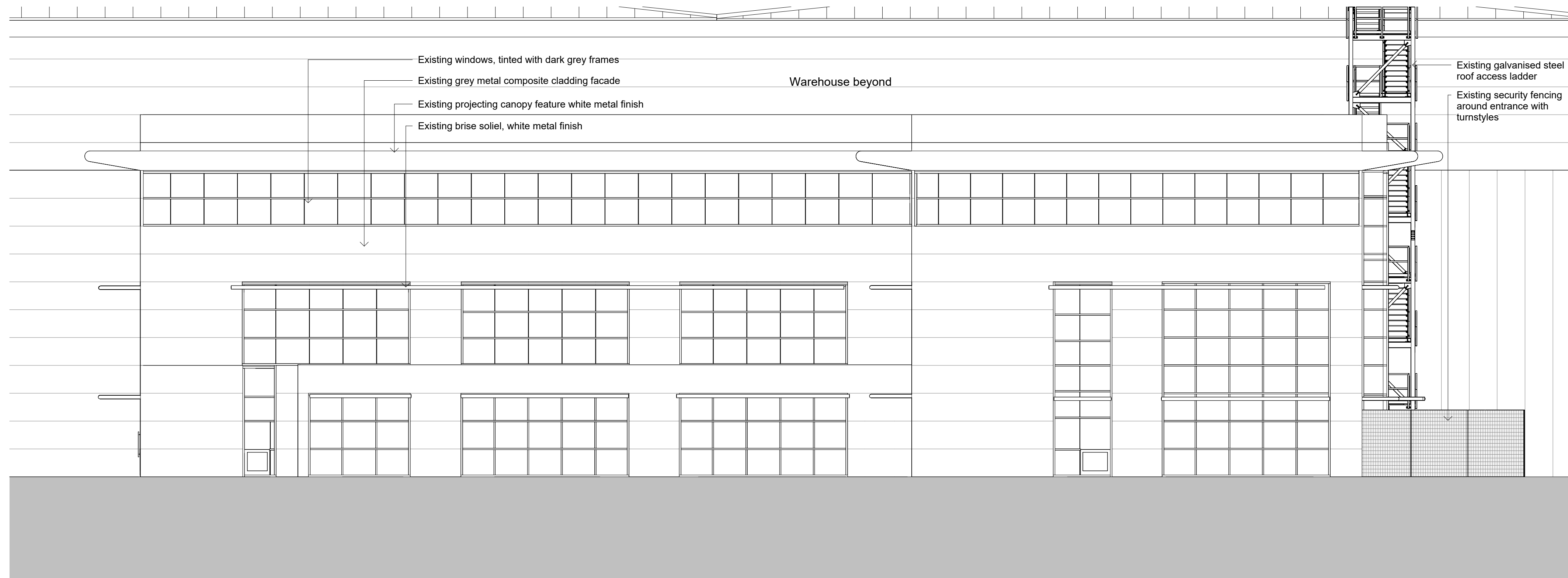
Existing ancillary office - Existing South Elevation