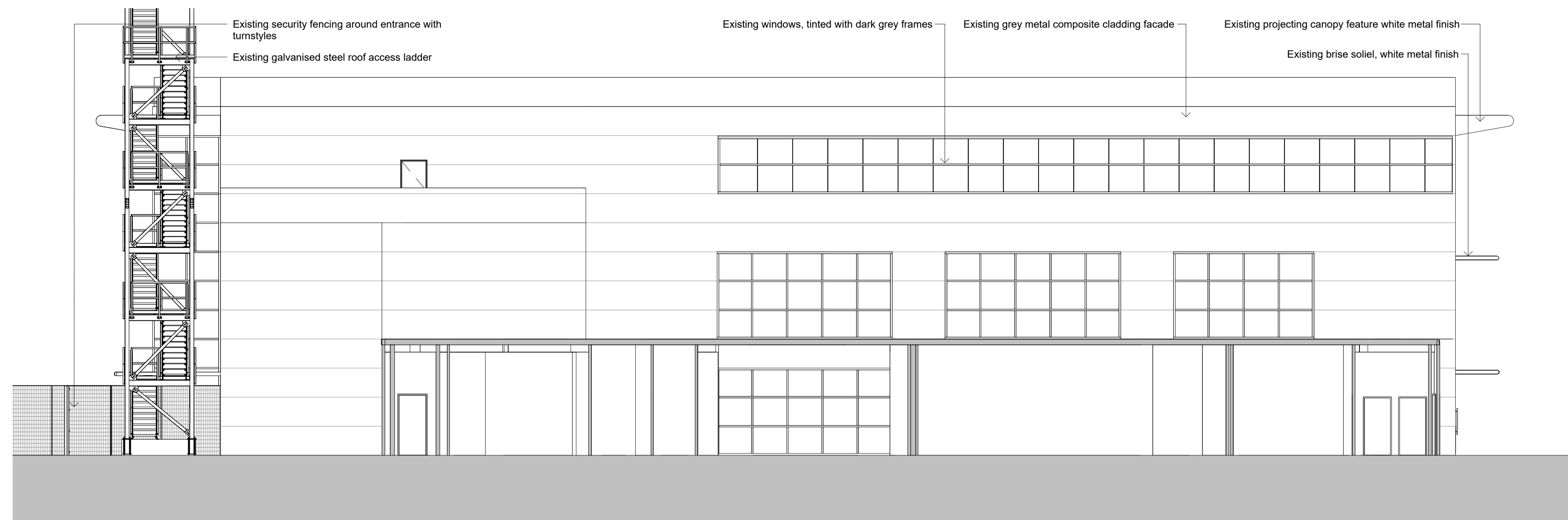
Existing ancillary office - Existing North Elevation 1:100