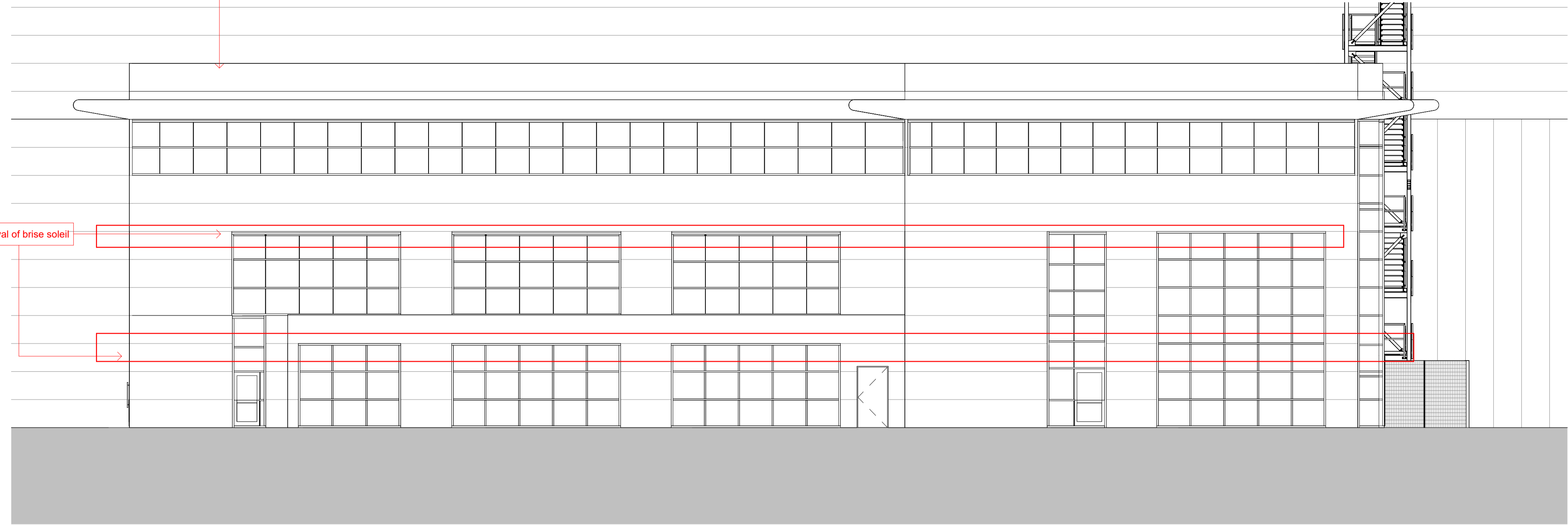
S Existing ancillary office - Proposed South Elevation 1 : 100