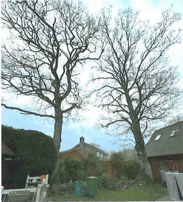
The oaks – T1 right, T2 left