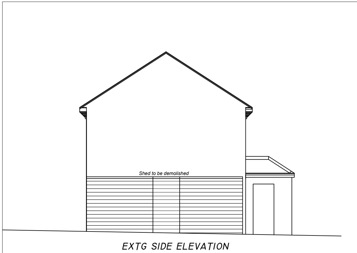
EXTG SIDE ELEVATION