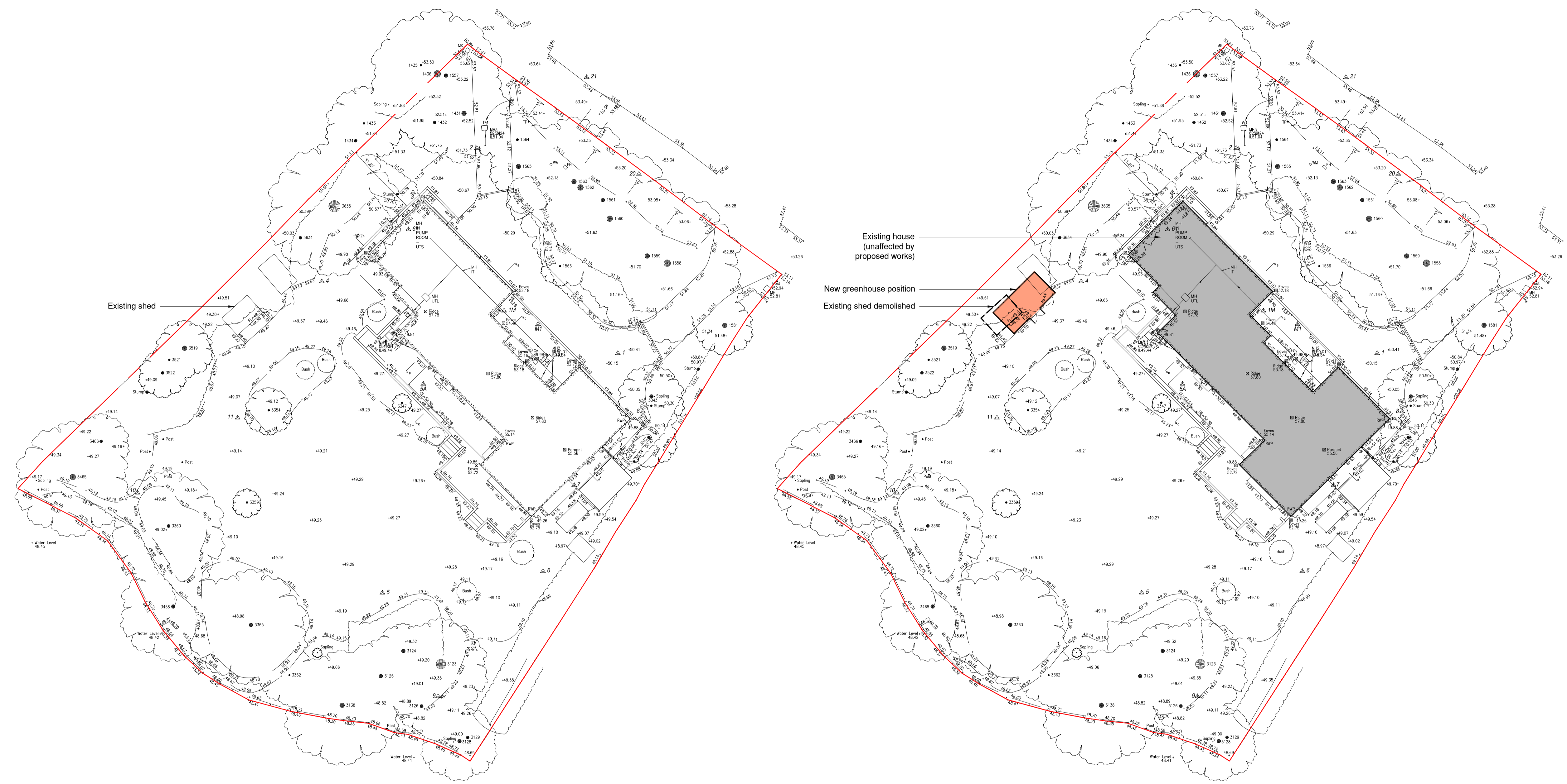
01 Existing site plan 010 1:250