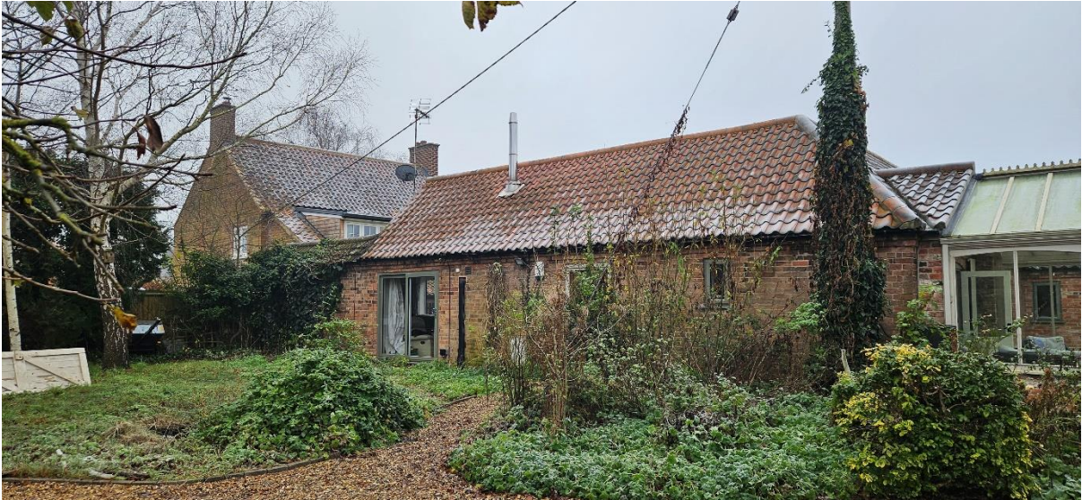
Plate 1 – External overview