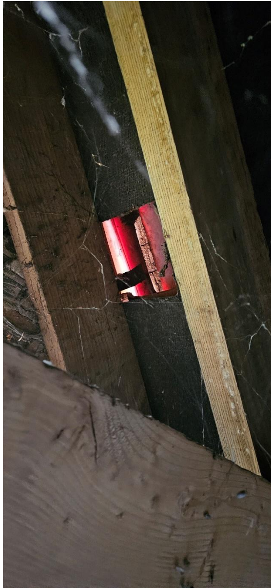
Plate 10 – Roof ventilation hole – cobwebs covering the opening