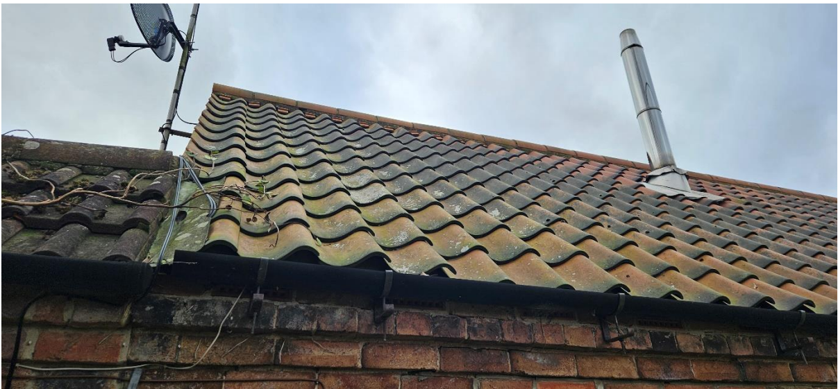
Plate 2 – General condition of roof