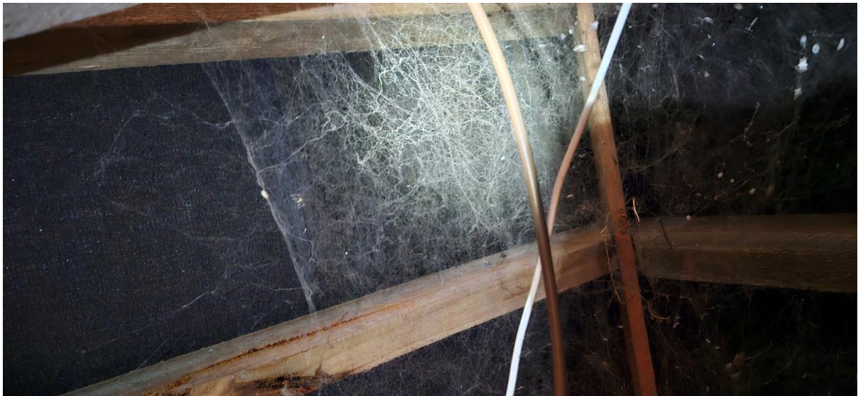
Plate 18 – cobwebs in roof space