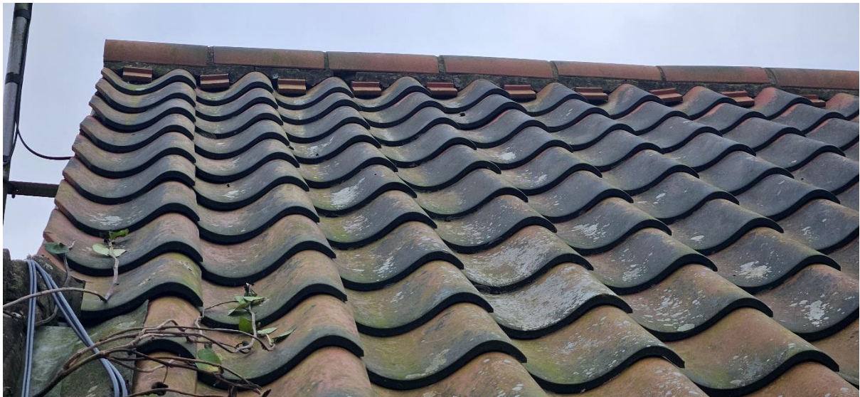
Plate 4 – Slight defect in ridge tile mortar, but no depth to the opening