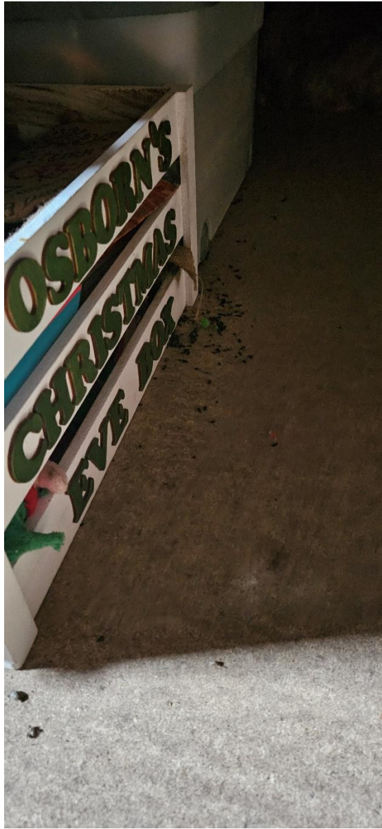
Plate 10 – Rodent droppings – “finger test” confirmed not bat