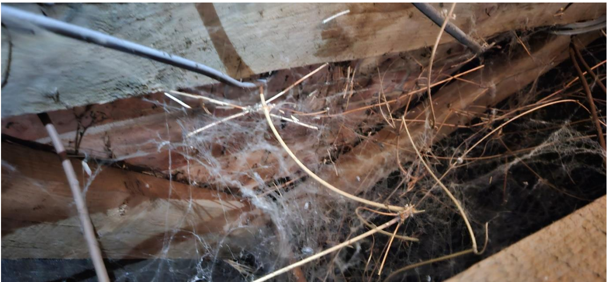
Plate 16 – cobwebs in roof space