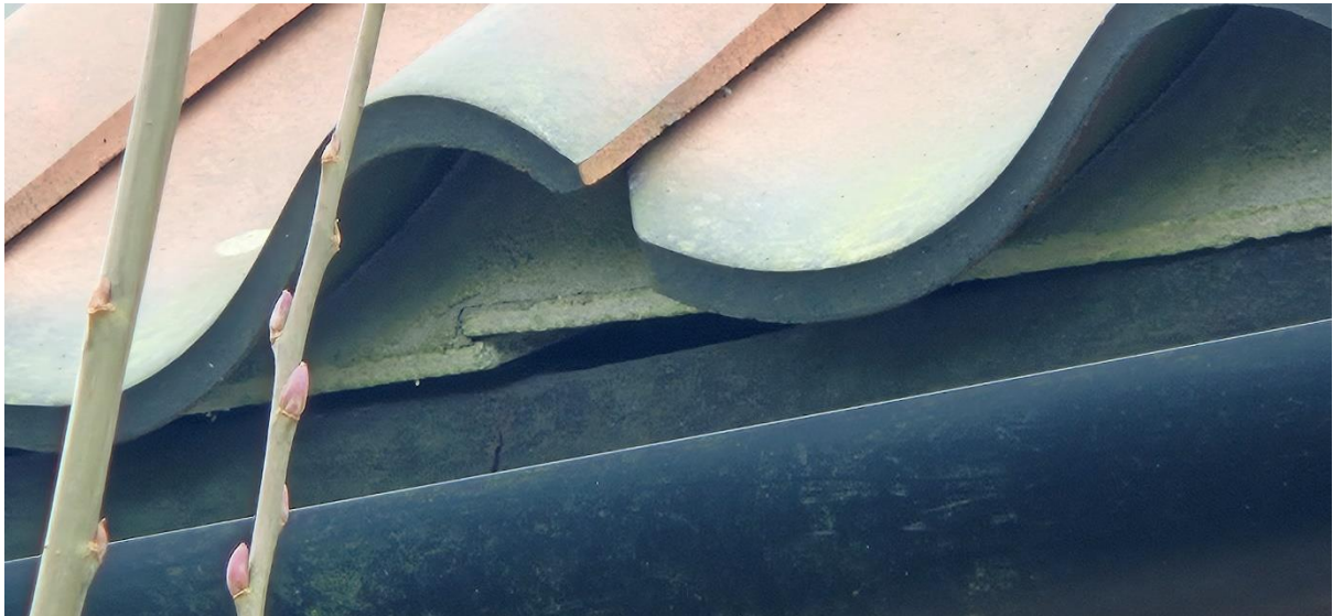
Plate 7 – Opening in base tiles – no bat signs