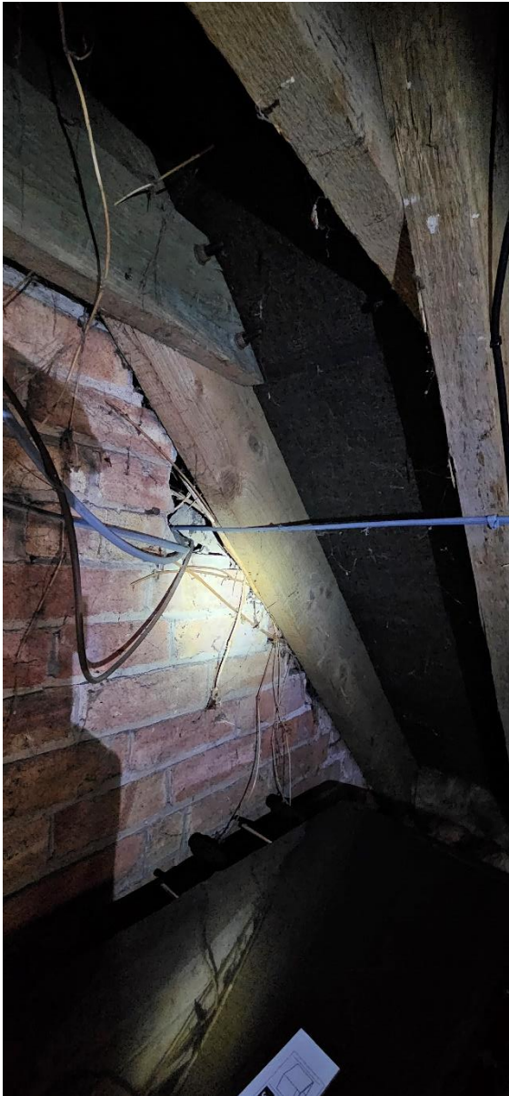
Plate 13 – hole in attic