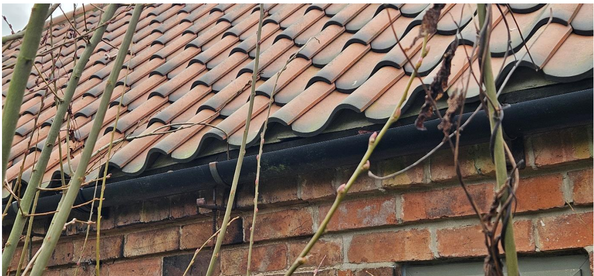
Plate 8 – Opening in base tile – wide angle – no bat signs