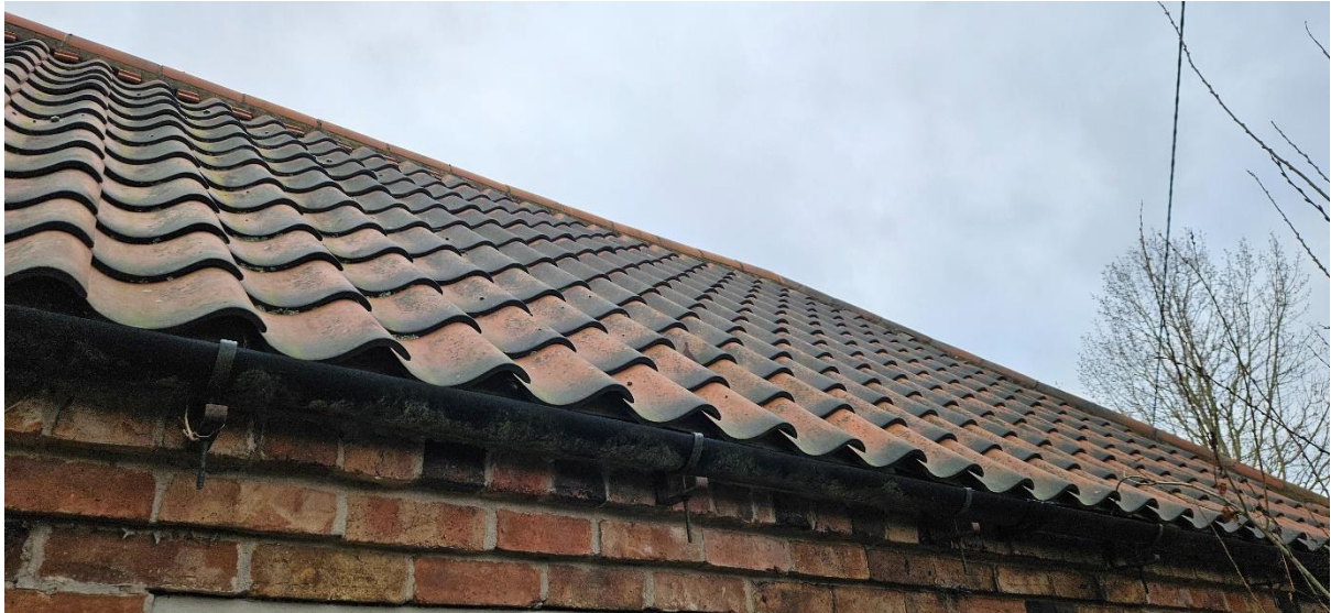
Plate 3 – General condition of roof