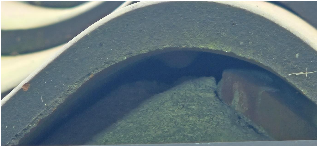
Plate 6 – Opening in base tiles – no bat signs