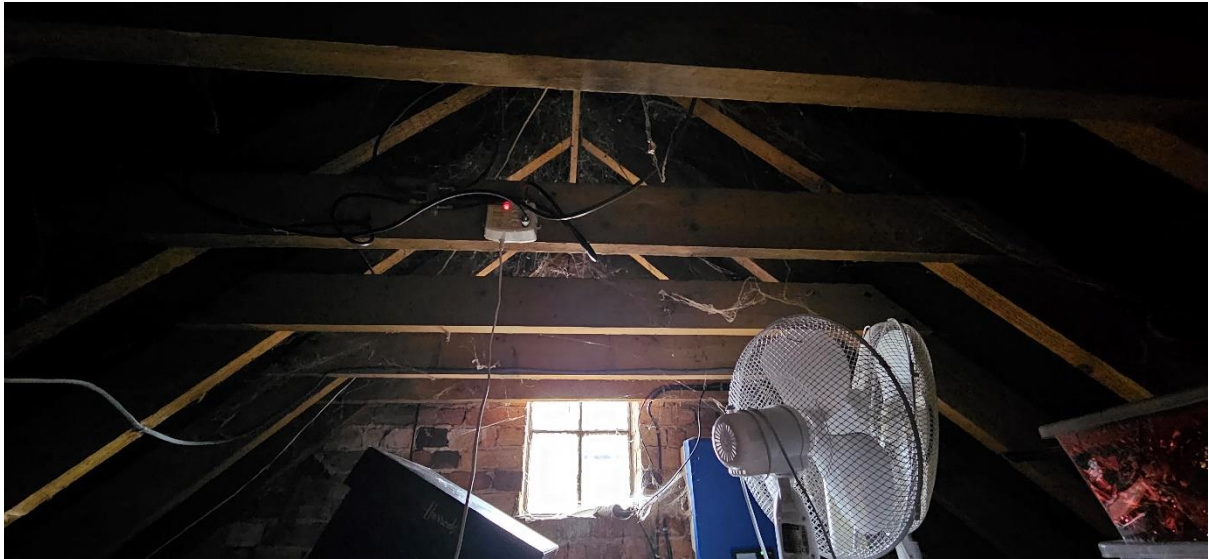
Plate 12 – Cobwebs in loft space