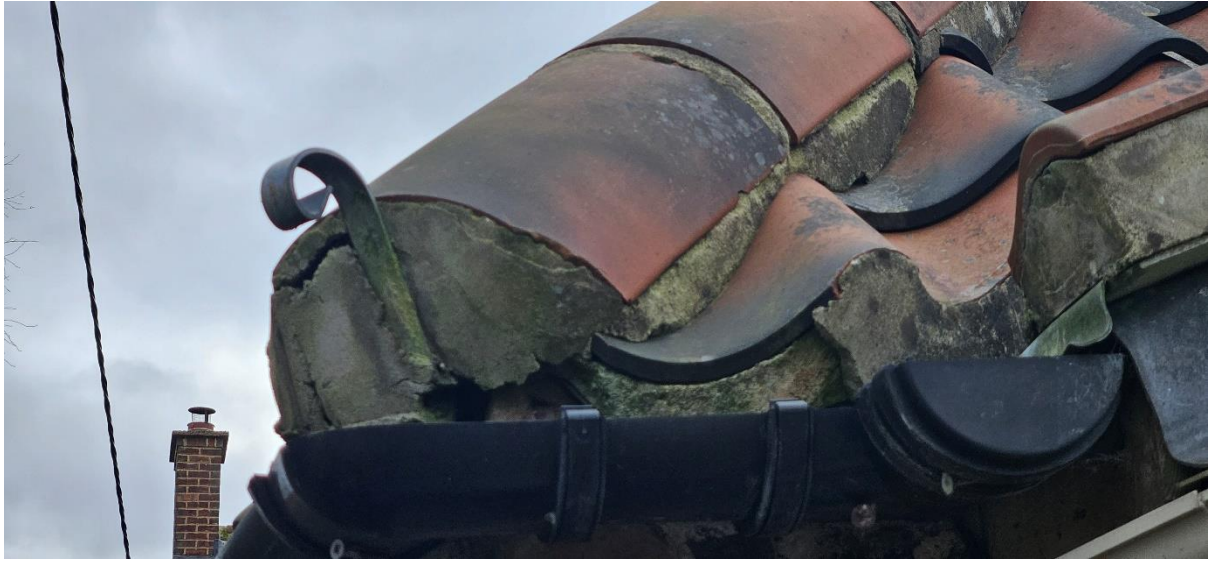
Plate 9 – opening at base of hip ridge tile – no bat signs evident