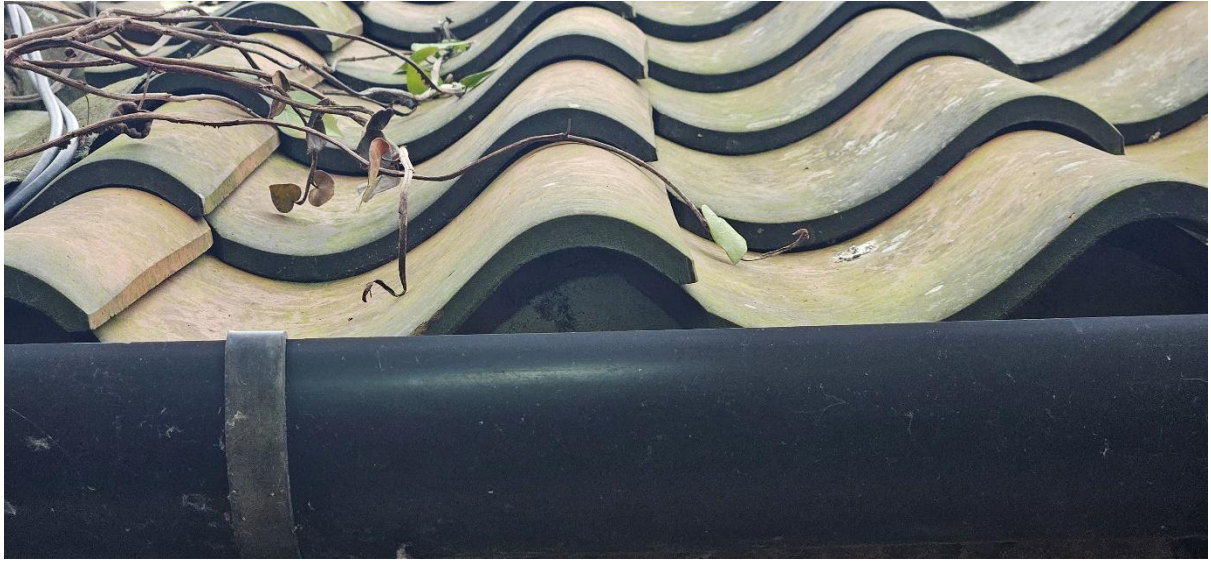
Plate 5 – General condition of base mortar