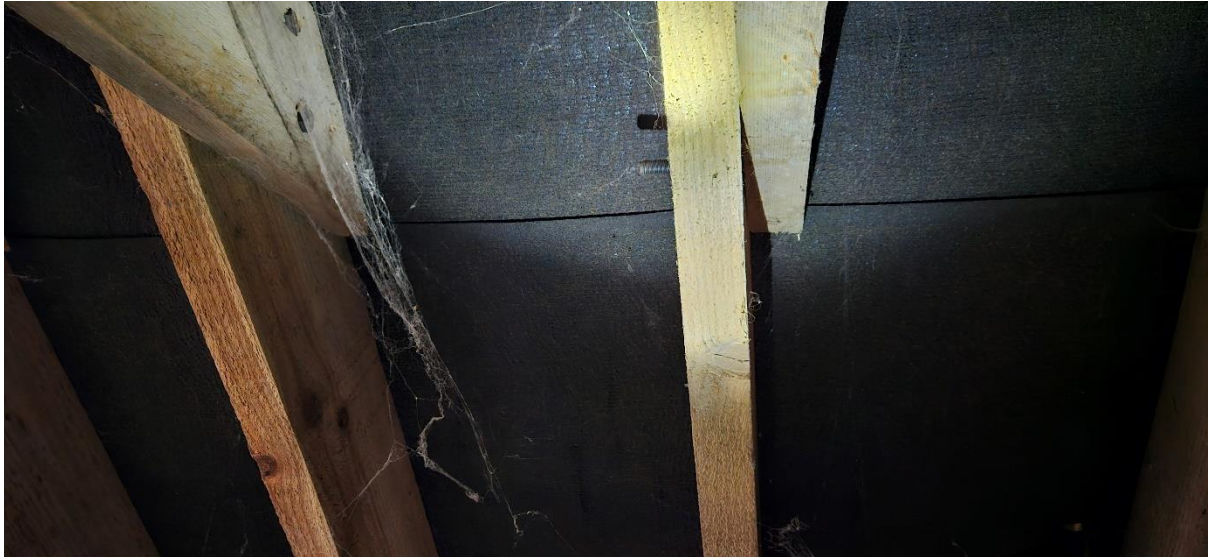
Plate 17 – condition of felt lining to roof – no gapping