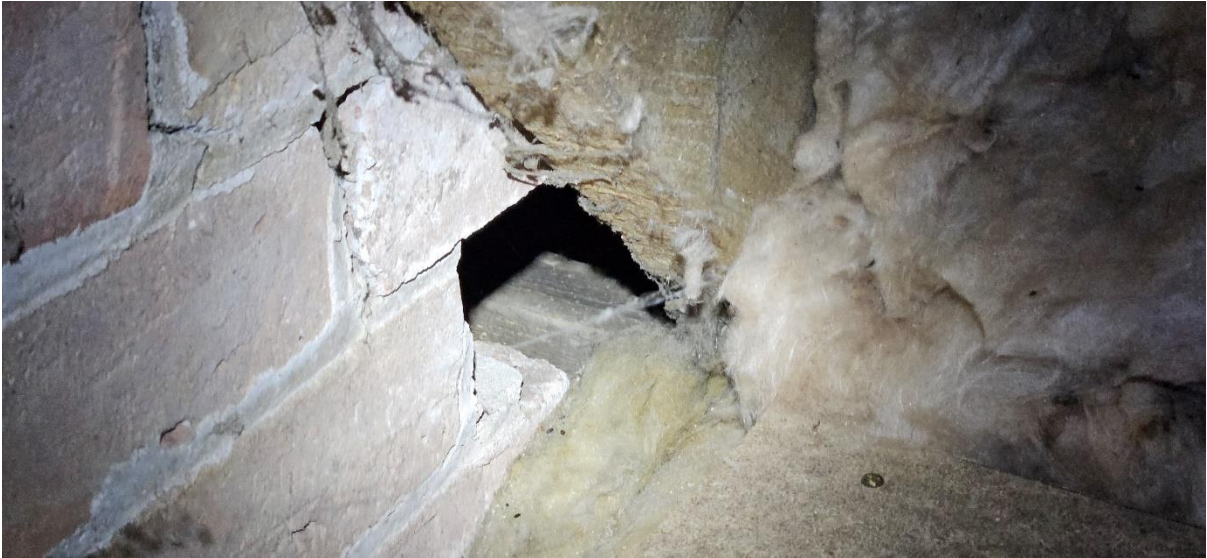
Plate 15 – hole in attic – cobwebs covering