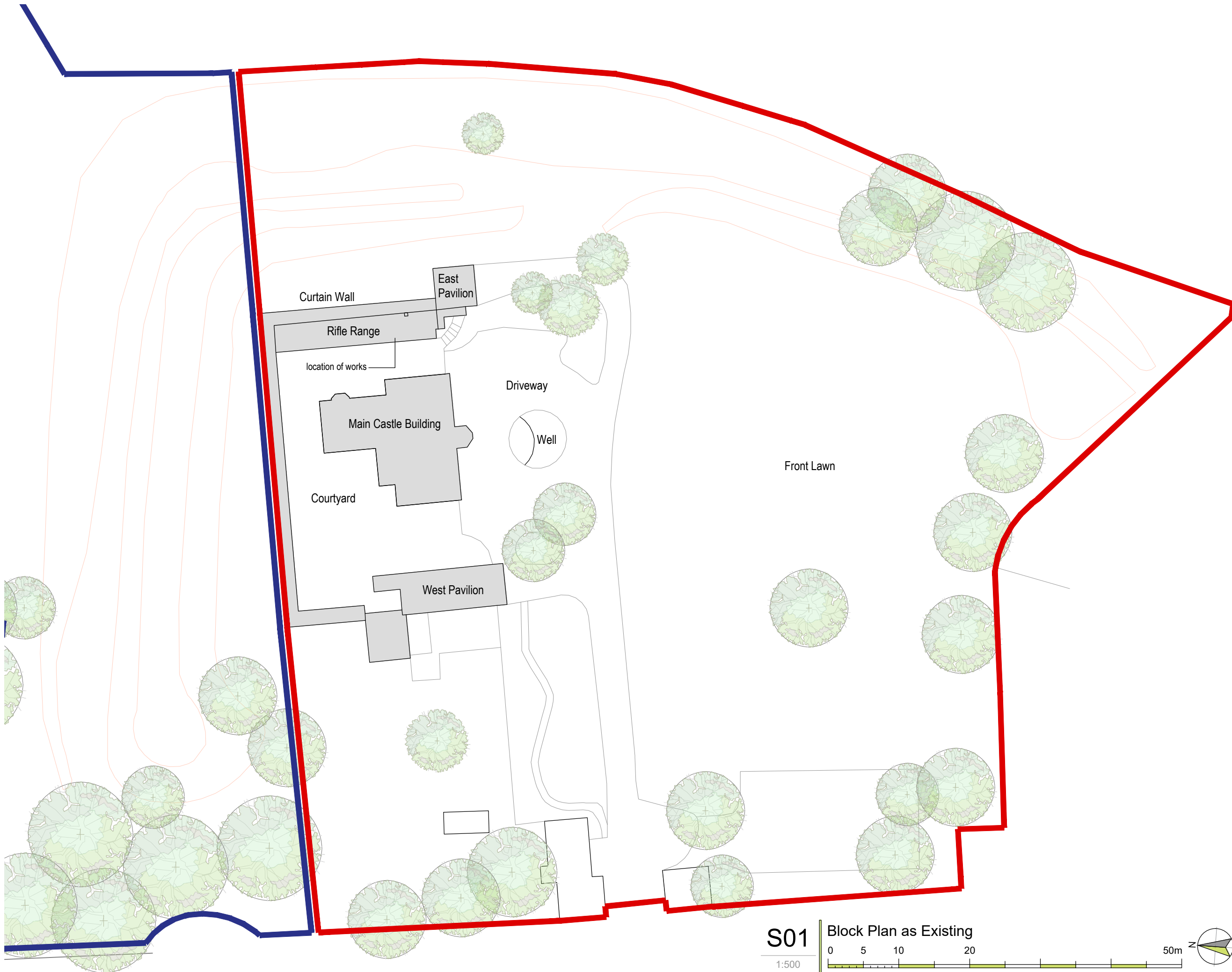
S01 Block Plan as Existing