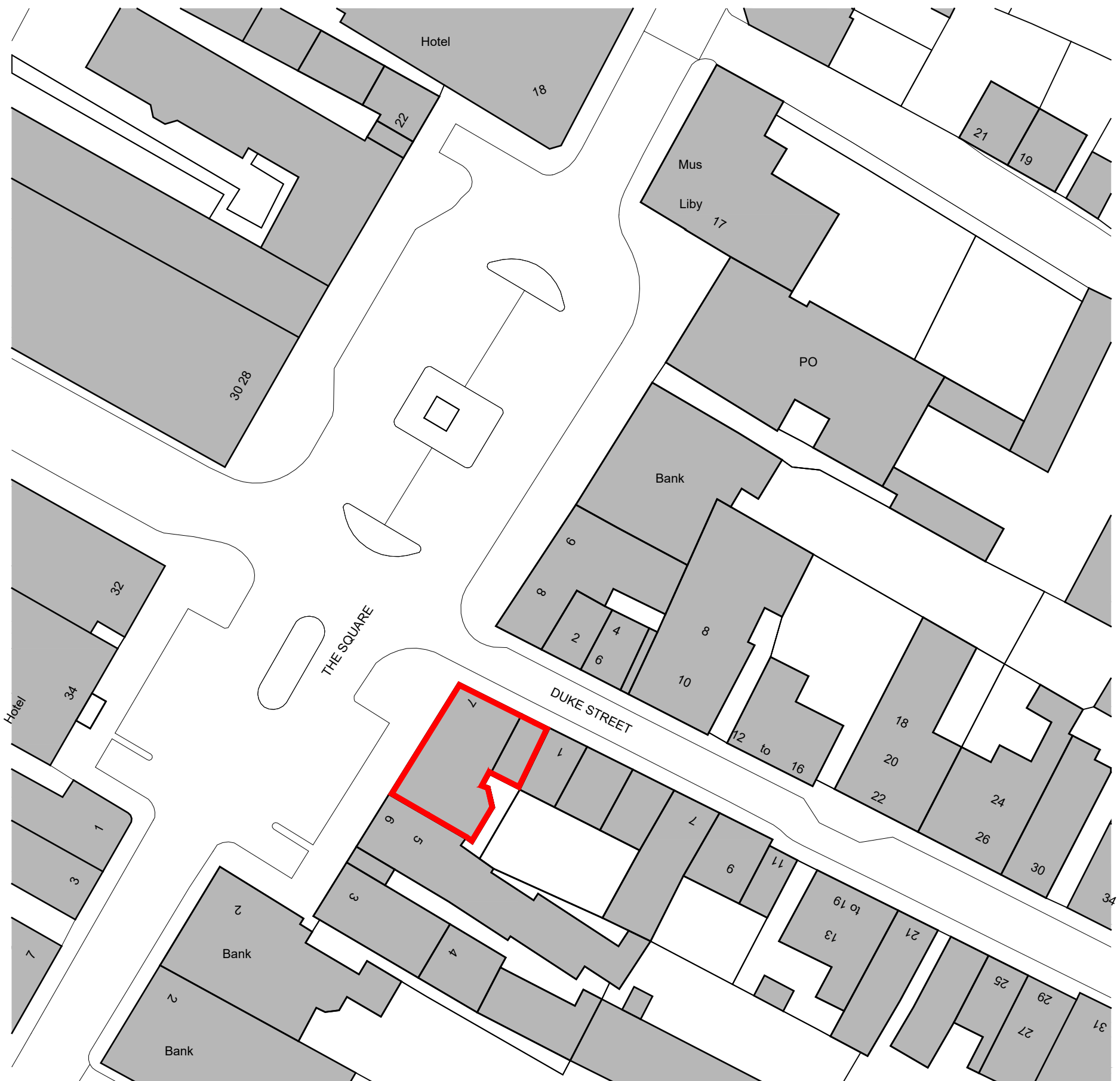
Site Location Plan Scale 1:500