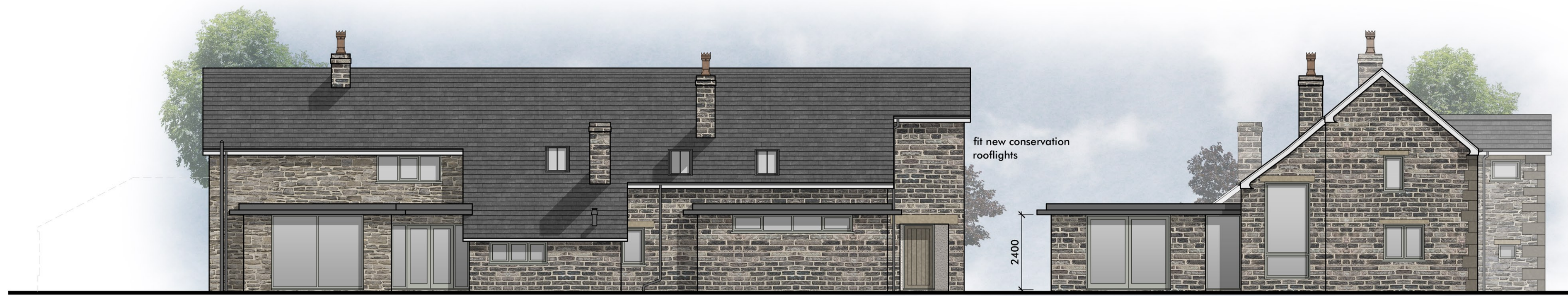
Plot 6 REAR