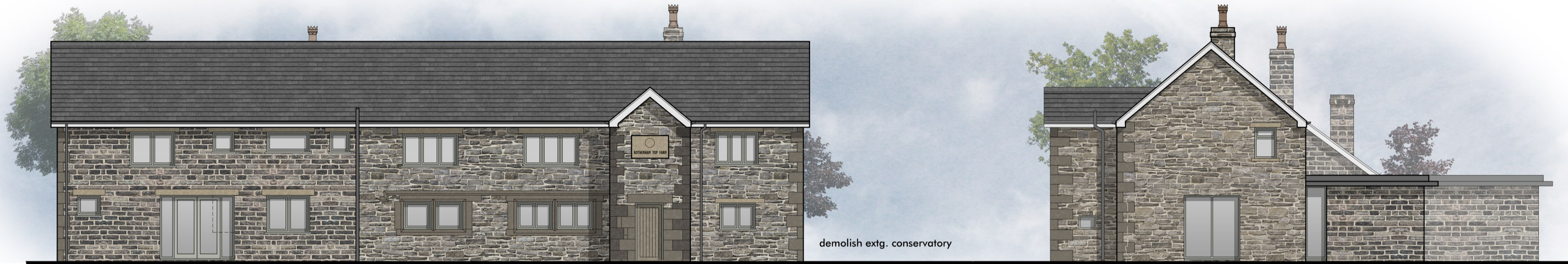
Plot 7 FRONT