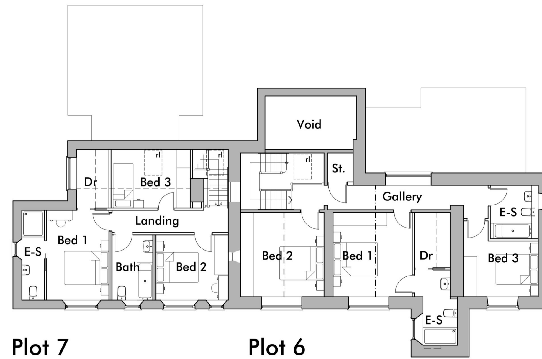
Plot 7 FIRST FLOOR PLAN

GF 114.39m 2 FF 77.44m 2 Total 191.83m 2 (2064ft. 2 )