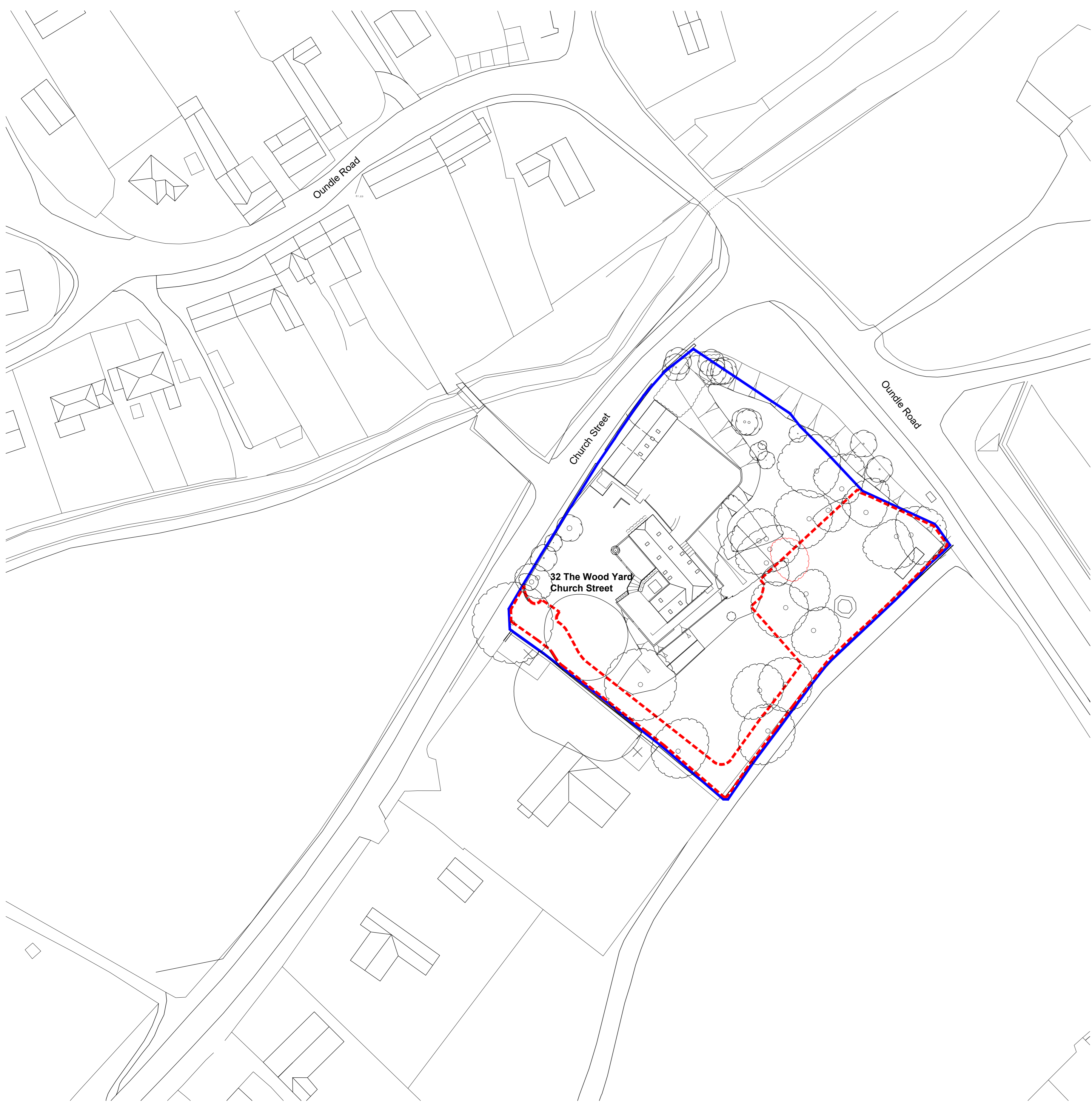
01 - Site Location Plan (Scale 1:500 @ A0)