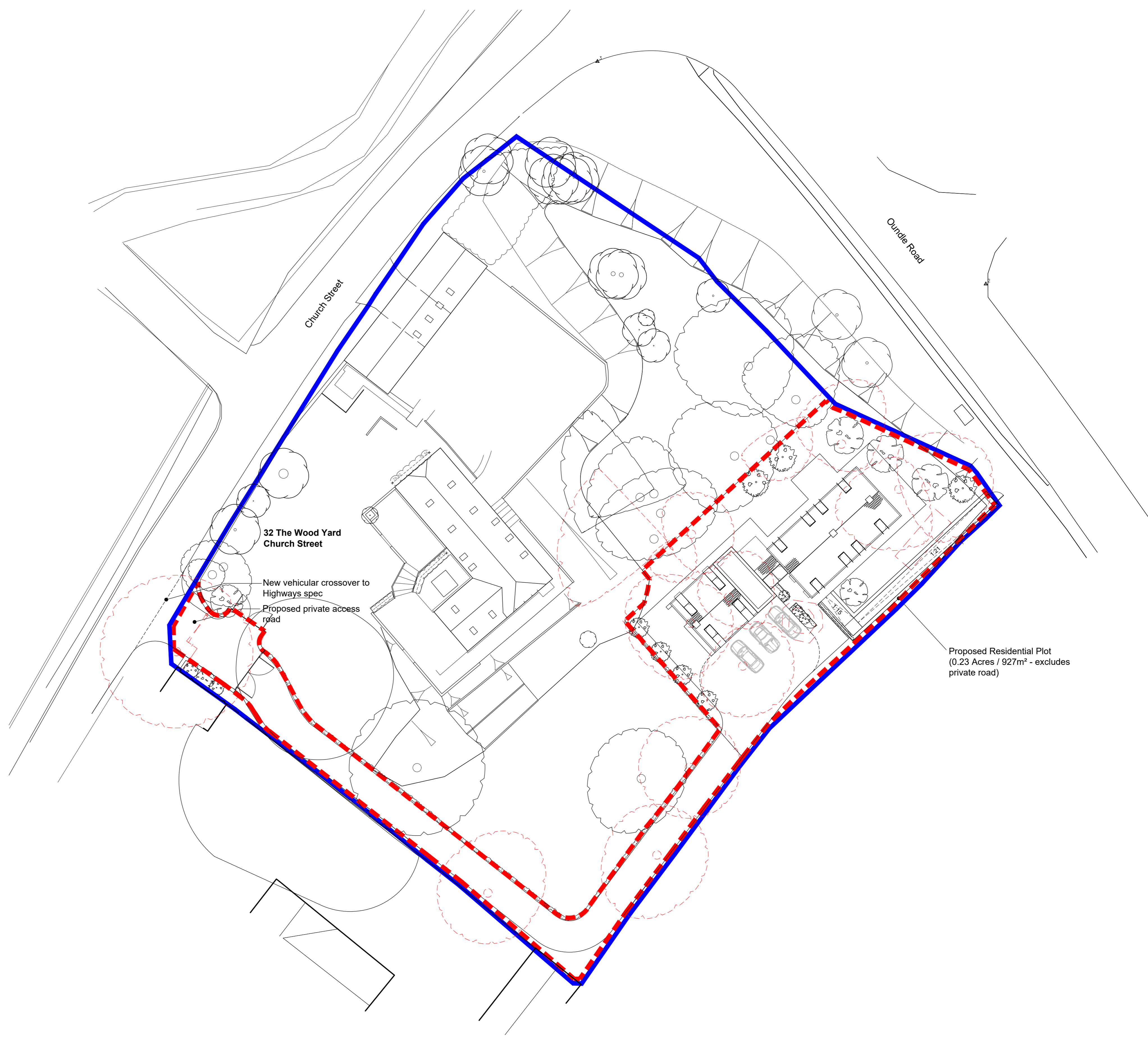
02 - Proposed Site Plan (Scale 1:250 @ A0)