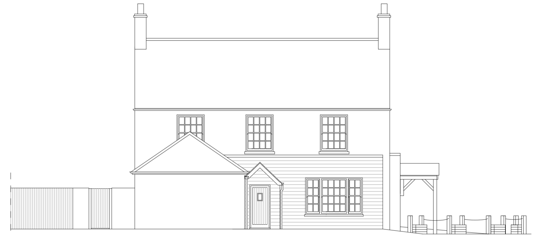
EAST FACING ELEVATION