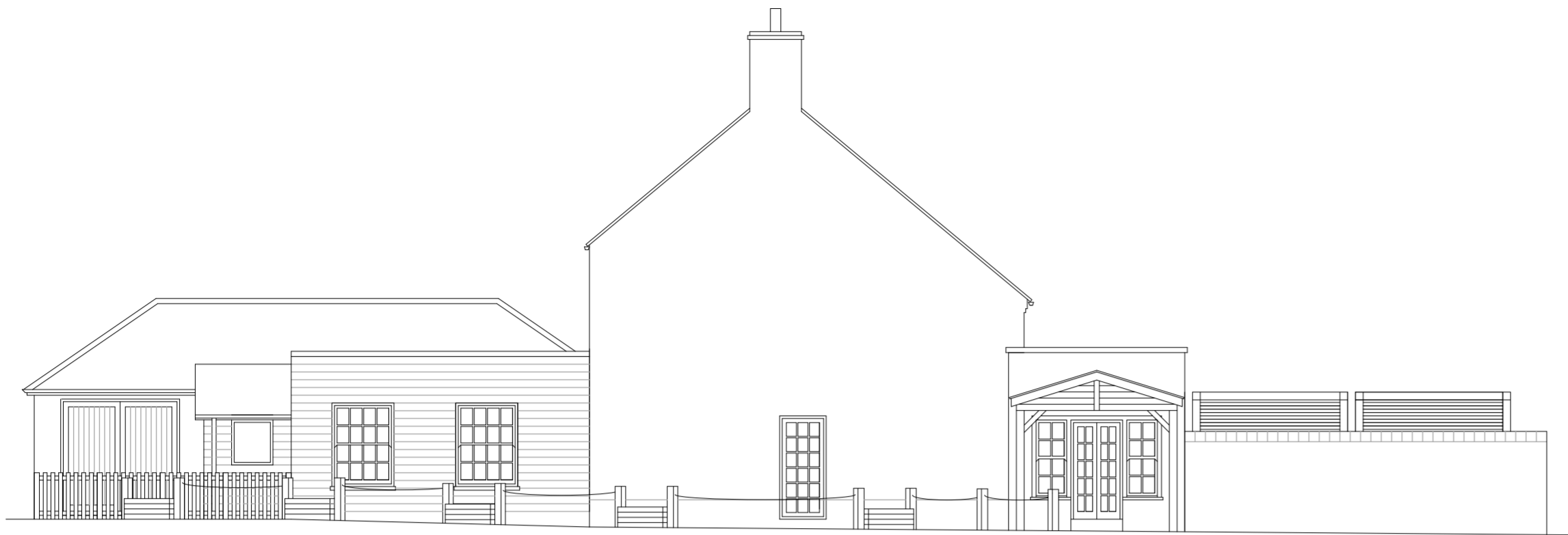
NORTH FACING ELEVATION