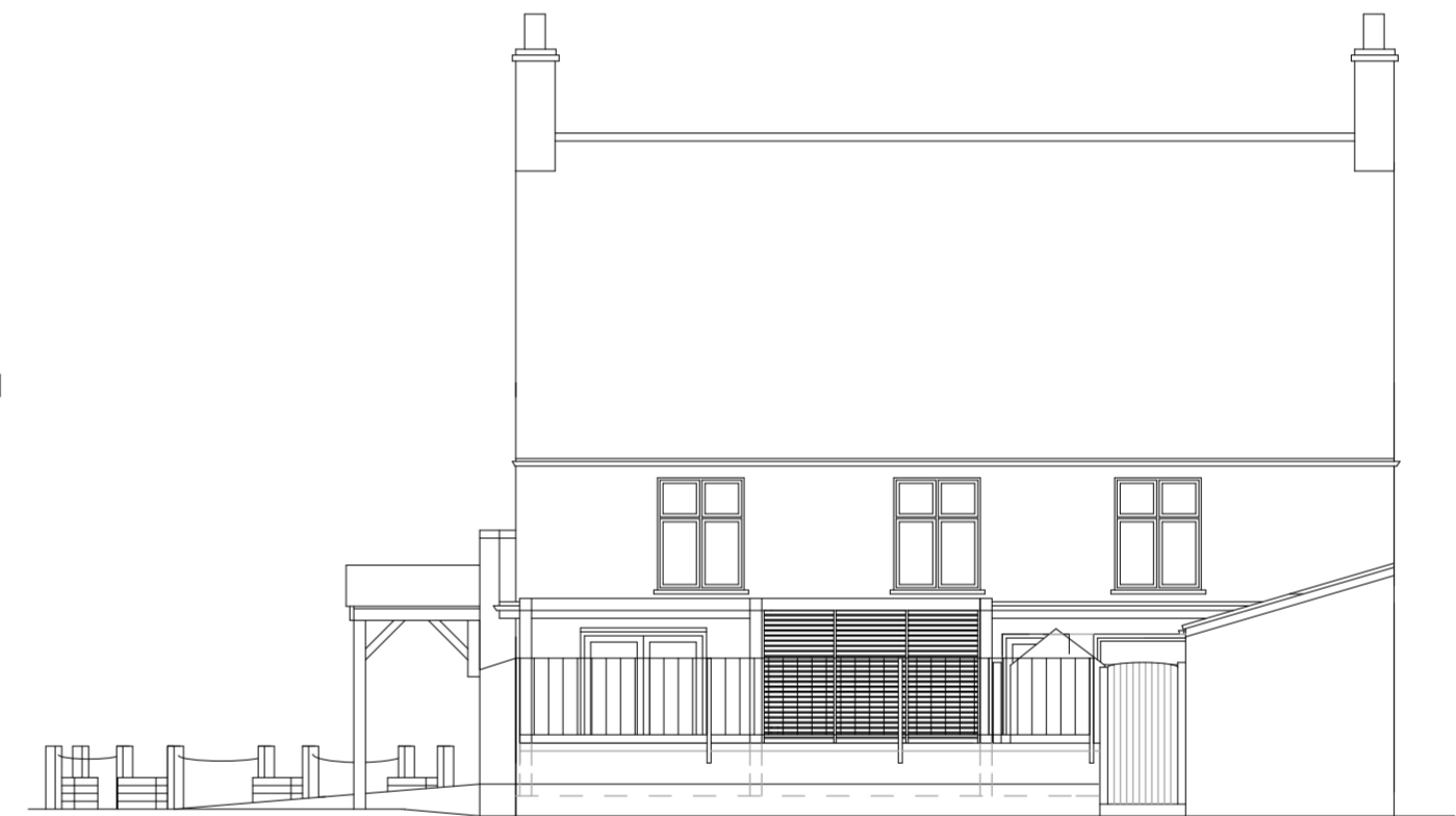
WEST FACING ELEVATION

REV A - 29/3/24 - WINDOW TO BOTTLE STORE AMENDED