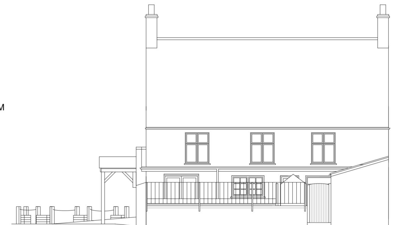
WEST FACING ELEVATION

REV A - 29/3/24 - WINDOW TO BOTTLE STORE AMENDED