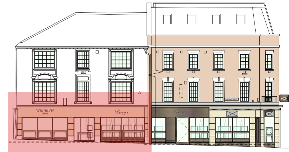
00 REFERENCE ELEVATION Scale: 1:200

All drawings are indicative. Contractor to provide ROD drawings prior to manufacture for approval.