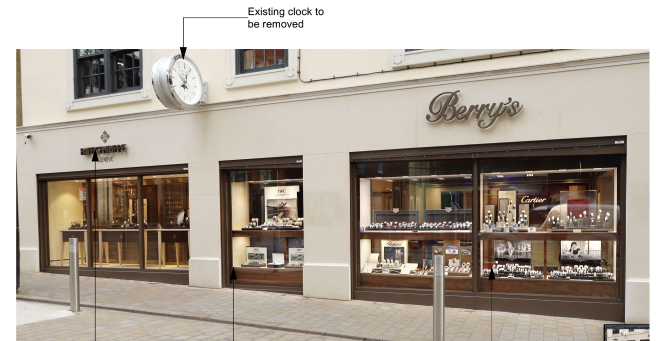
Existing Shopfront Photo