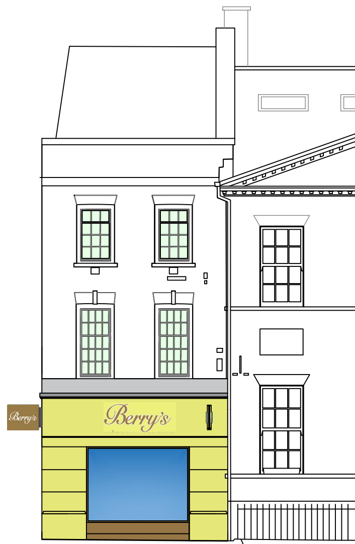
EXISTING RIGHT FLANK ELEVATION SCALE - 1:100 @ A3