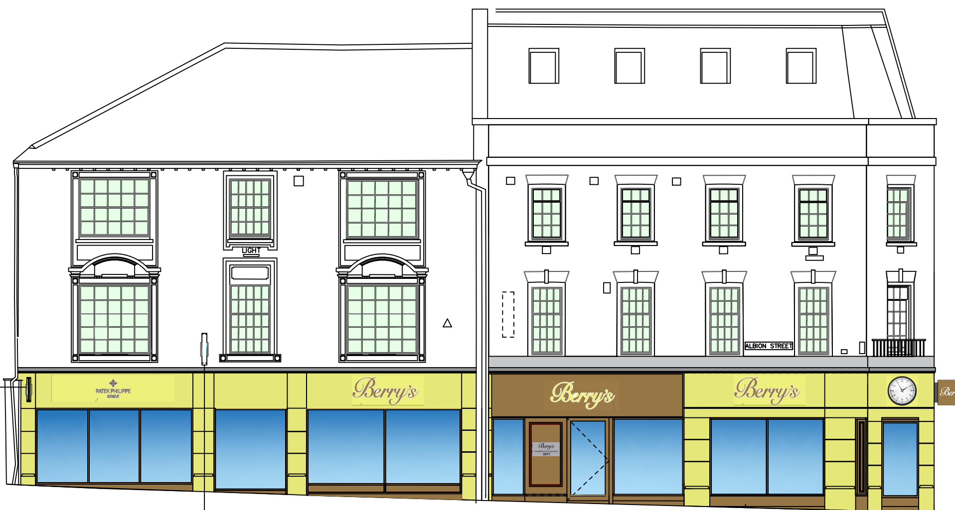
EXISTING FRONT ELEVATION SCALE - 1:100 @ A3