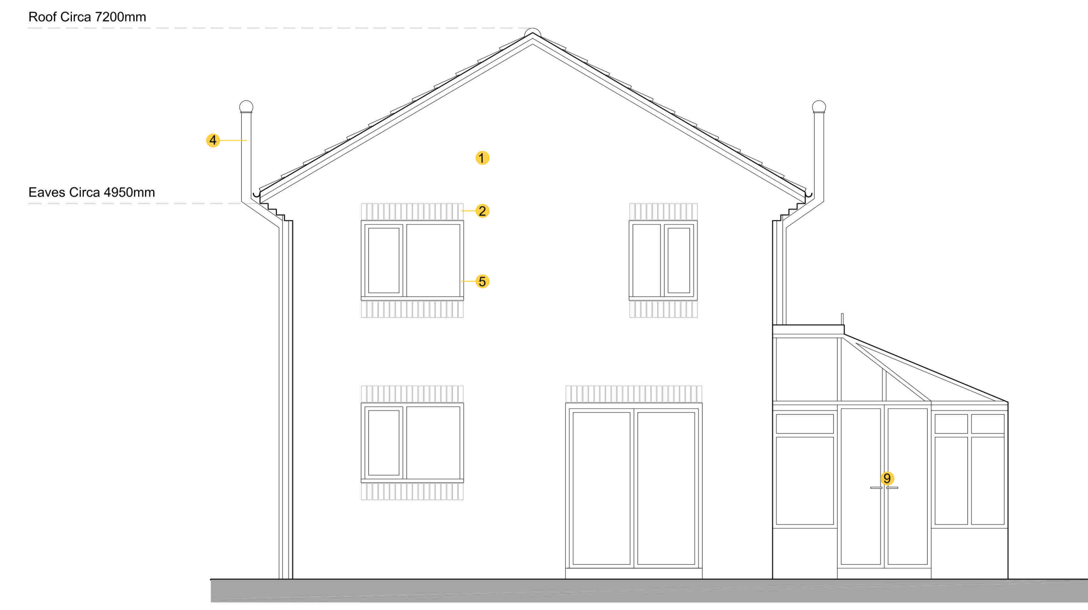
NE Existing Elevation