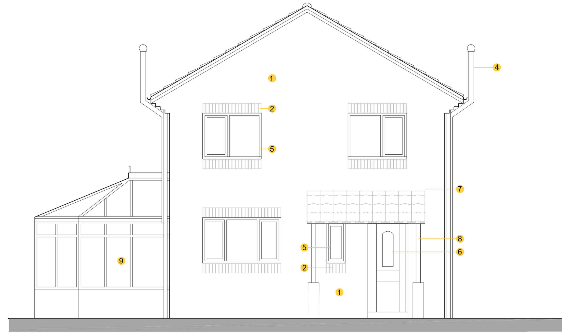
SW Existing Elevation