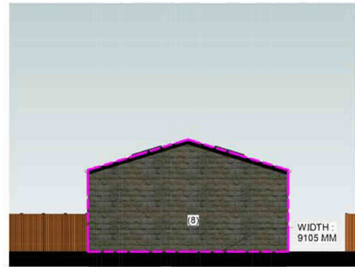
PROPOSED WEST ELEVATION 1:100