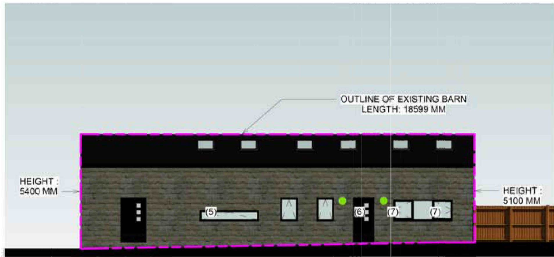
PROPOSED NORTH ELEVATION 1:100

● Outdoor wall light Eyrin with motion detector from www.lights.com