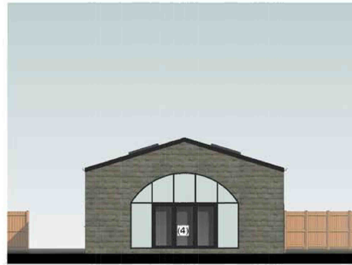
PROPOSED EAST ELEVATION 1:100

● Outdoor wall light Eyrin with motion detector from www.lights.com