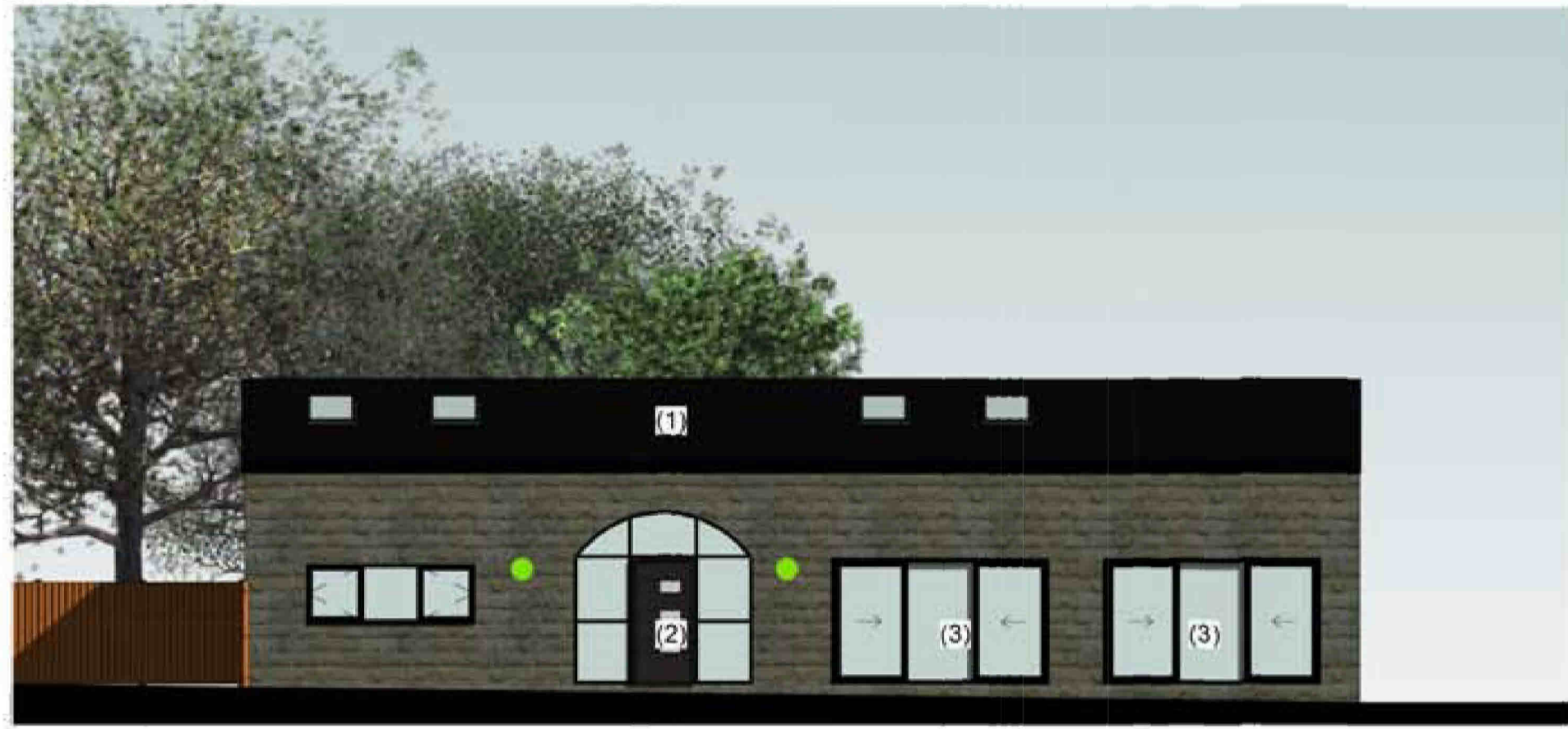
PROPOSED SOUTH ELEVATION 1:100