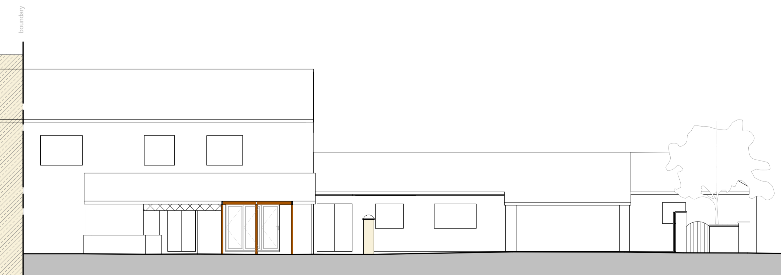
Site Section - South West Proposed