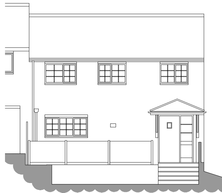
FRONT (STREET) ELEVATION (1:100)