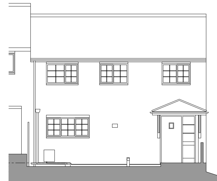
FRONT (WALL) ELEVATION (1:100)