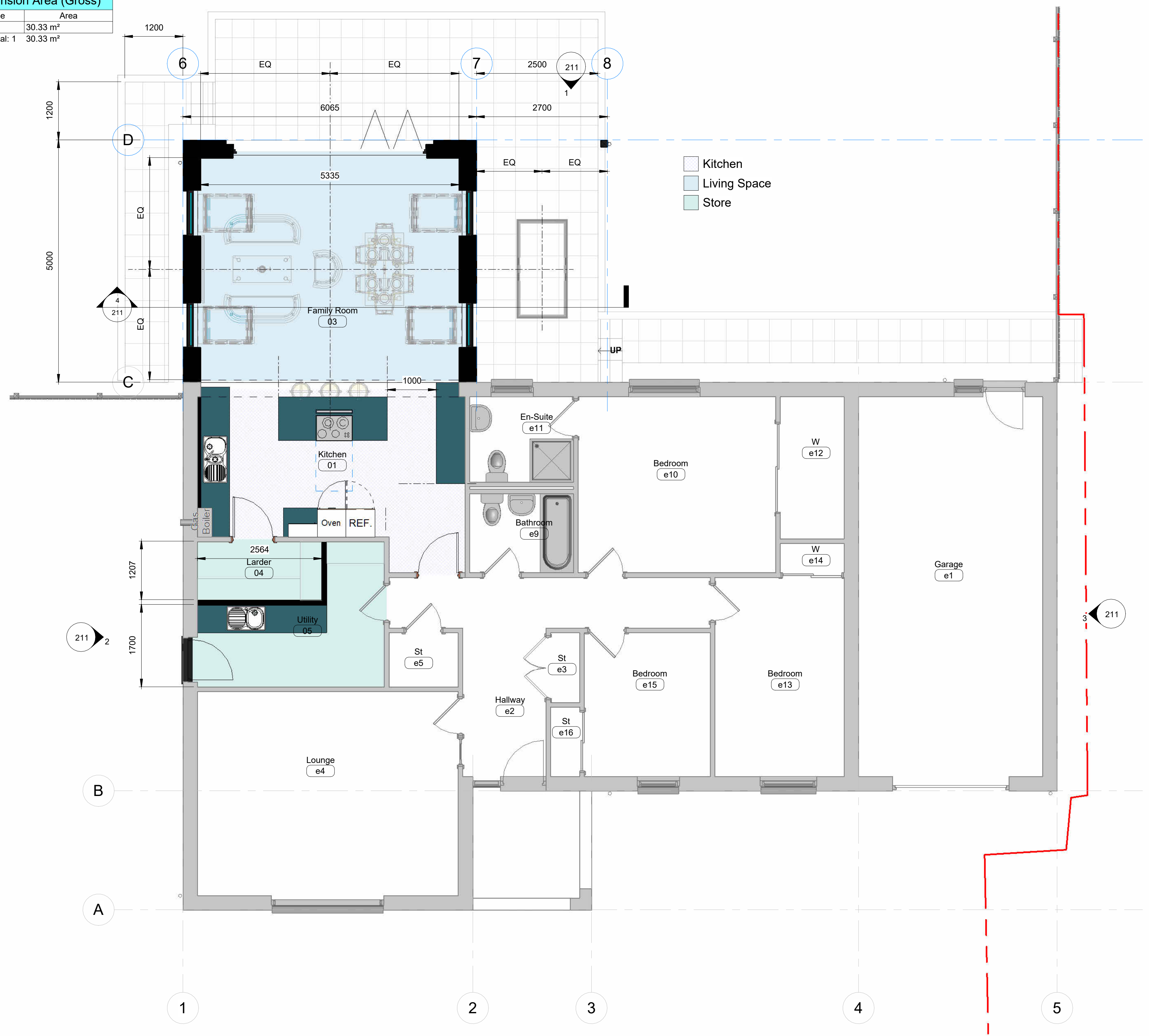
1 Proposed Ground Floor 1:50